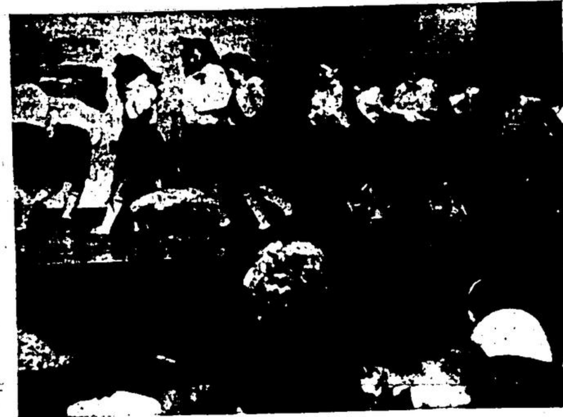
Brownies of the 8th Pack circle Holy Cross parish hall stage in a Scottish dance.

People attending North Georgetown District Brownies and Guides second annual Variety show in the new Holy Cross parish hall Thursday and Friday saw an entertaining program presented by Guides and Brownies from nine packs and companies.