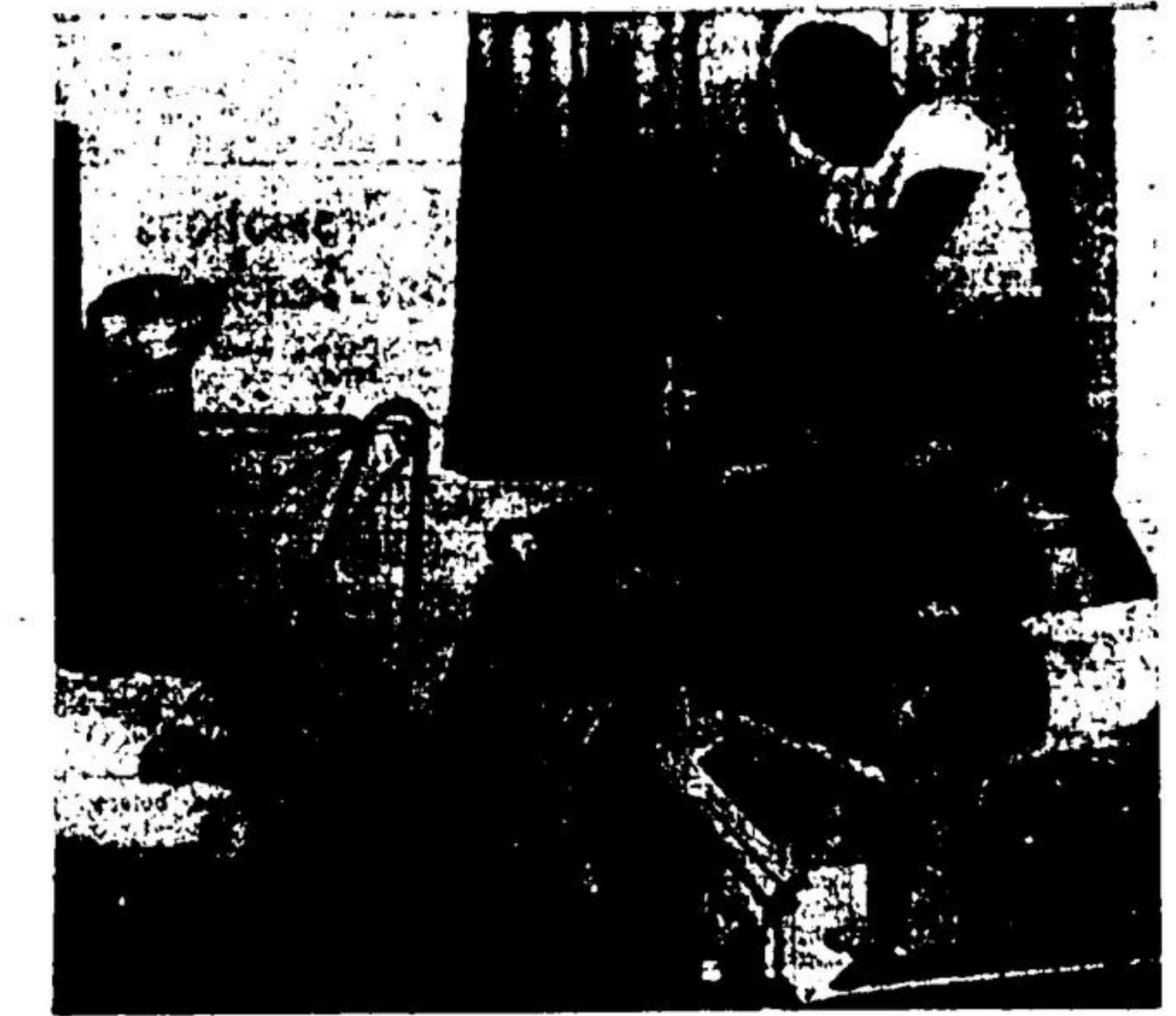
INSIDE ARE MANY conditioning devices including these exercis machines.