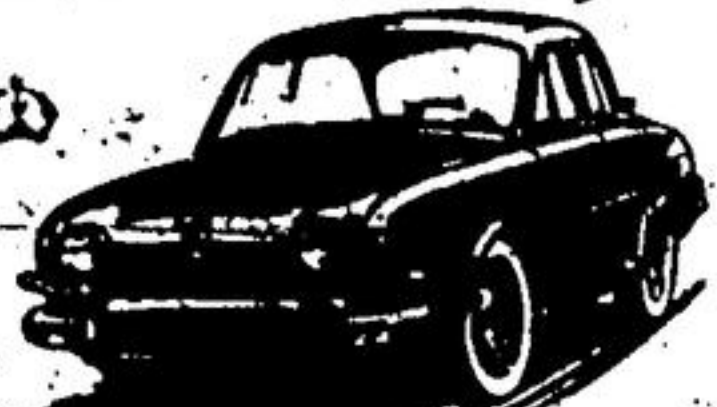
PARTS AND SERVICE EVERYWHERE YOU GO

Take care of your Renault with proper service and maintenance. We have factory-trained personnel and factory-approved equipment to keep yours at peak operating efficiency. You can expect prompt courteous service at reasonable prices. Inspect our service facilities today, and look over the new Renaults in our showroom, too!