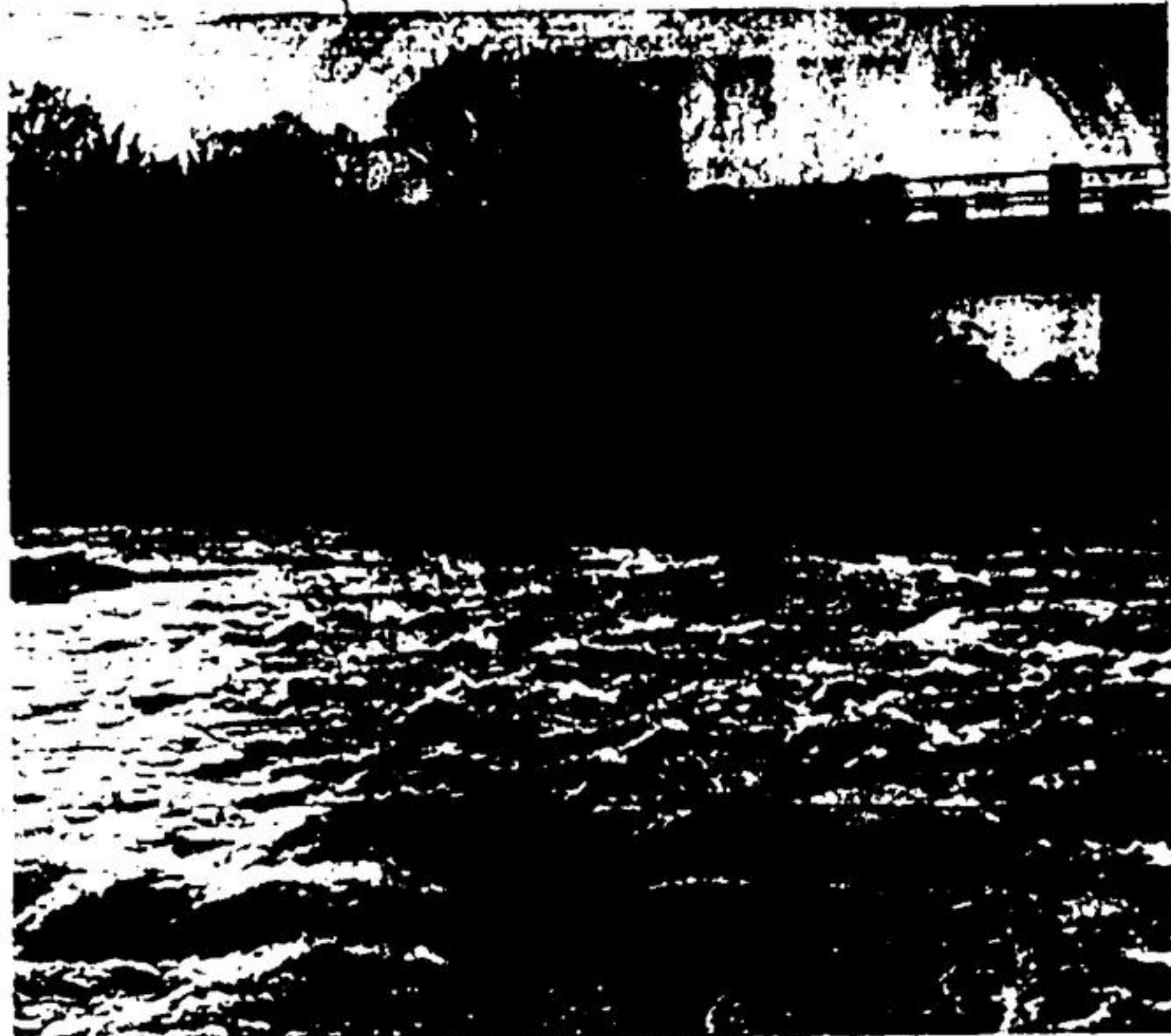
"THE CREDIT THROUGH GEORGETOWN... PRETTY BUT POLLUTED"

The date for next county board meeting is November 4th.