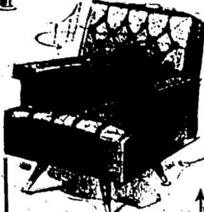
SOFT VINYL CHANNEL BACK SWIVEL ROCKER

Deep foam comfort under soft touch luxurious vinyl. Swivel complete circle, rock yourself to comfort.