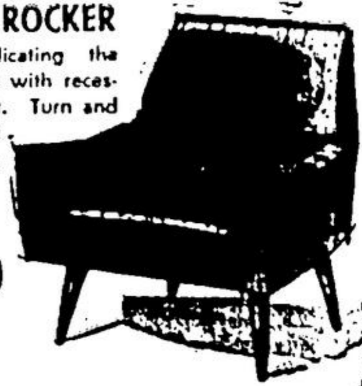
FOAM COMFORT CLUB CHAIR