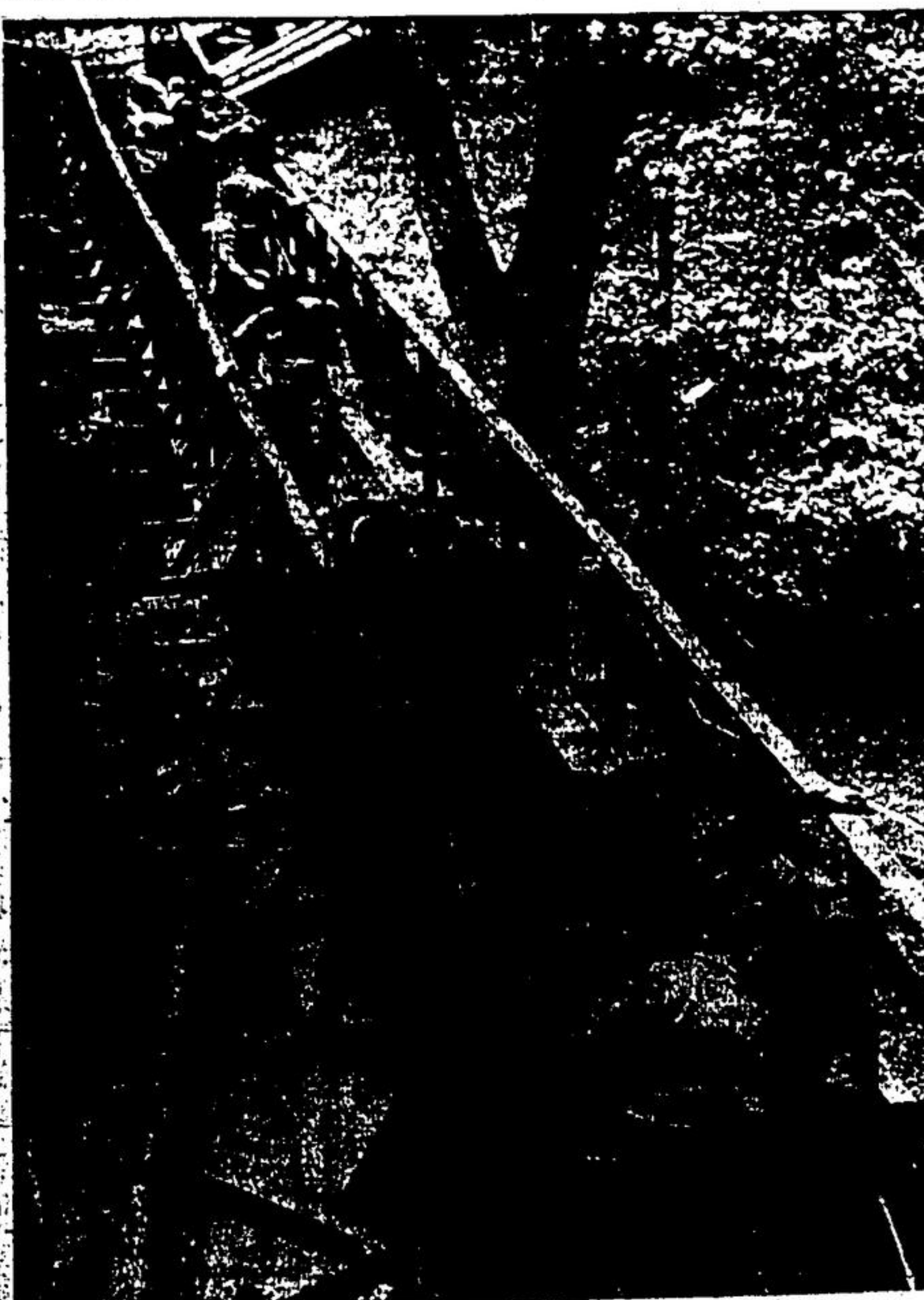
THIS IS THE BRIDGE at Camp Norval. A hundred and twenty feet long, it spans a gorge 50 feet deep, which divided the camp.