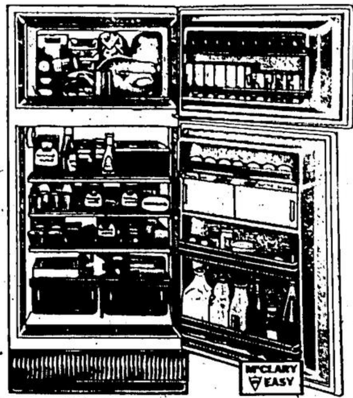
Model ZTC 1246

Refrigerators with a completely separate door to the freezer compartment are becoming more popular for reasons of practical convenience. But until now this feature was only available in the larger sizes. McClary-Easy has recognized that smaller families, too, would welcome this convenience.