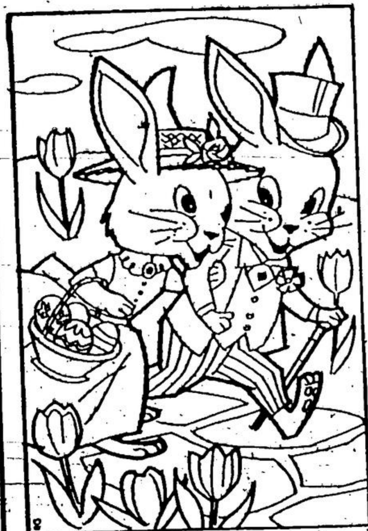
All dressed and ready for Easter Day, the Bunny family starts on its way.