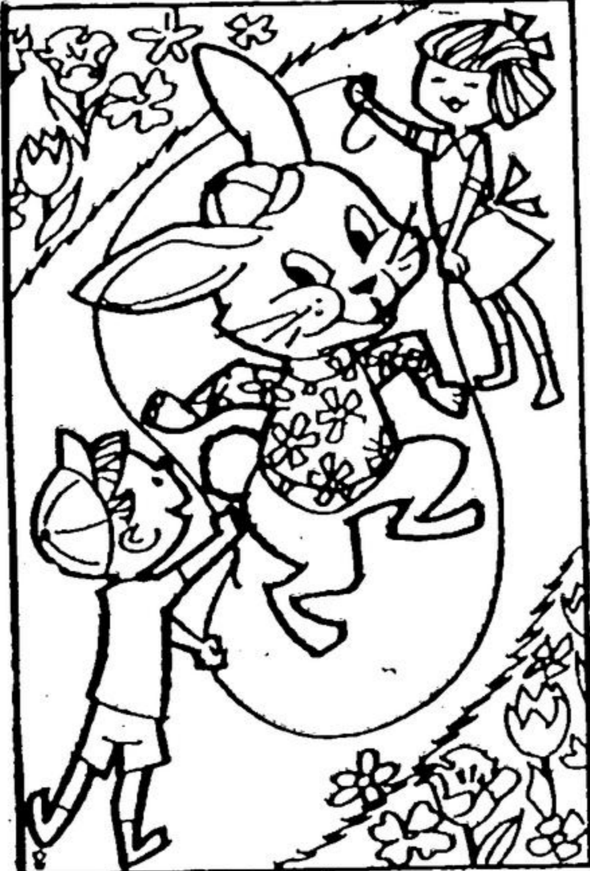
Jumping rope is fun to do and the Bunny wants a try at it, too!