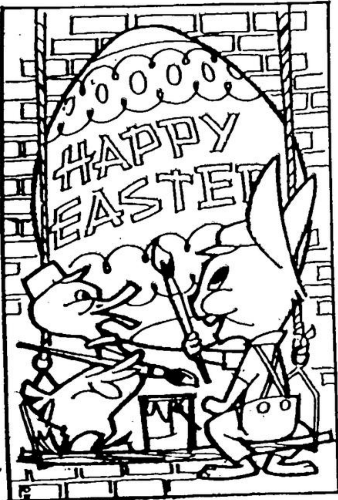
Here's an Easter greeting for all of you from the Easter Bunny and his friend the duck, too!

FIRST PRIZE $10.00 | SECOND PRIZE $7.50 | THIRD PRIZE $5.00