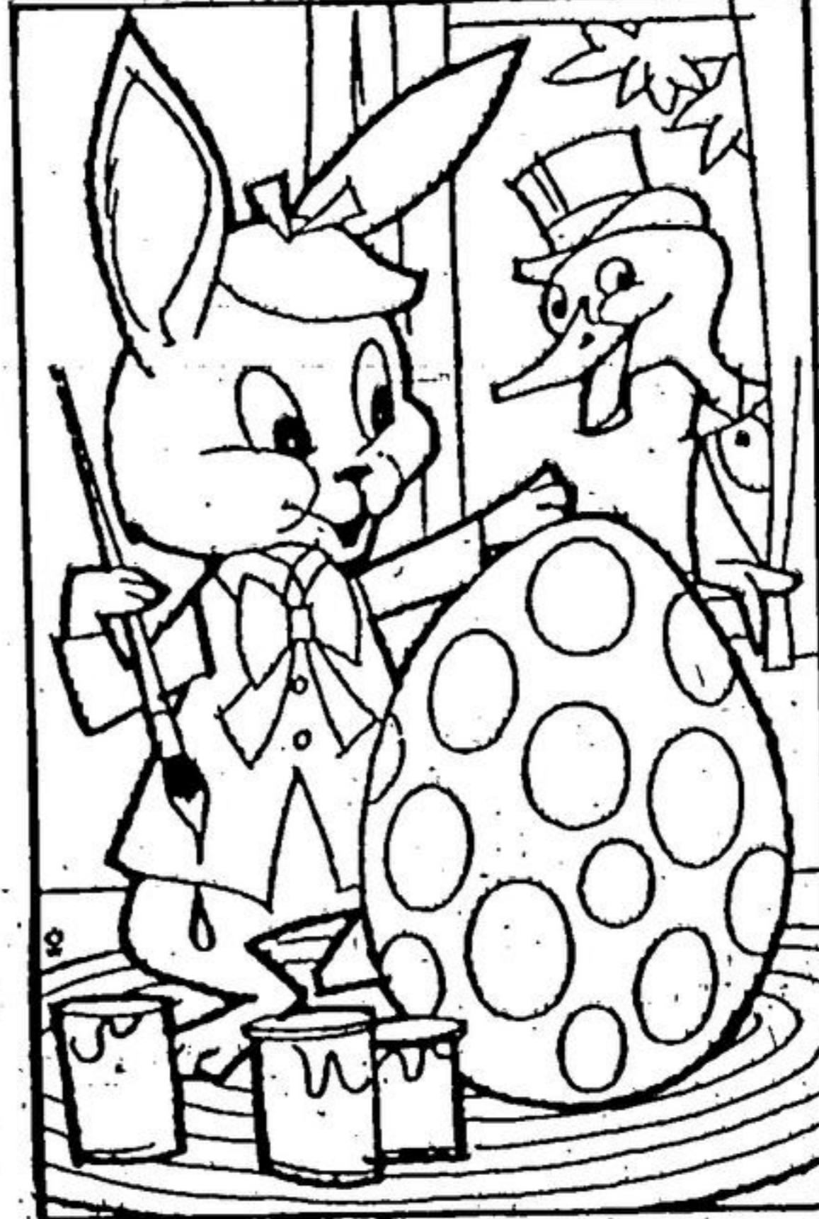
Bunny's painting eggs in every hue. Do you think he'll bring a lot to you?

Beaver Lumber Co., Ltd. 11 Water Street 877-2234