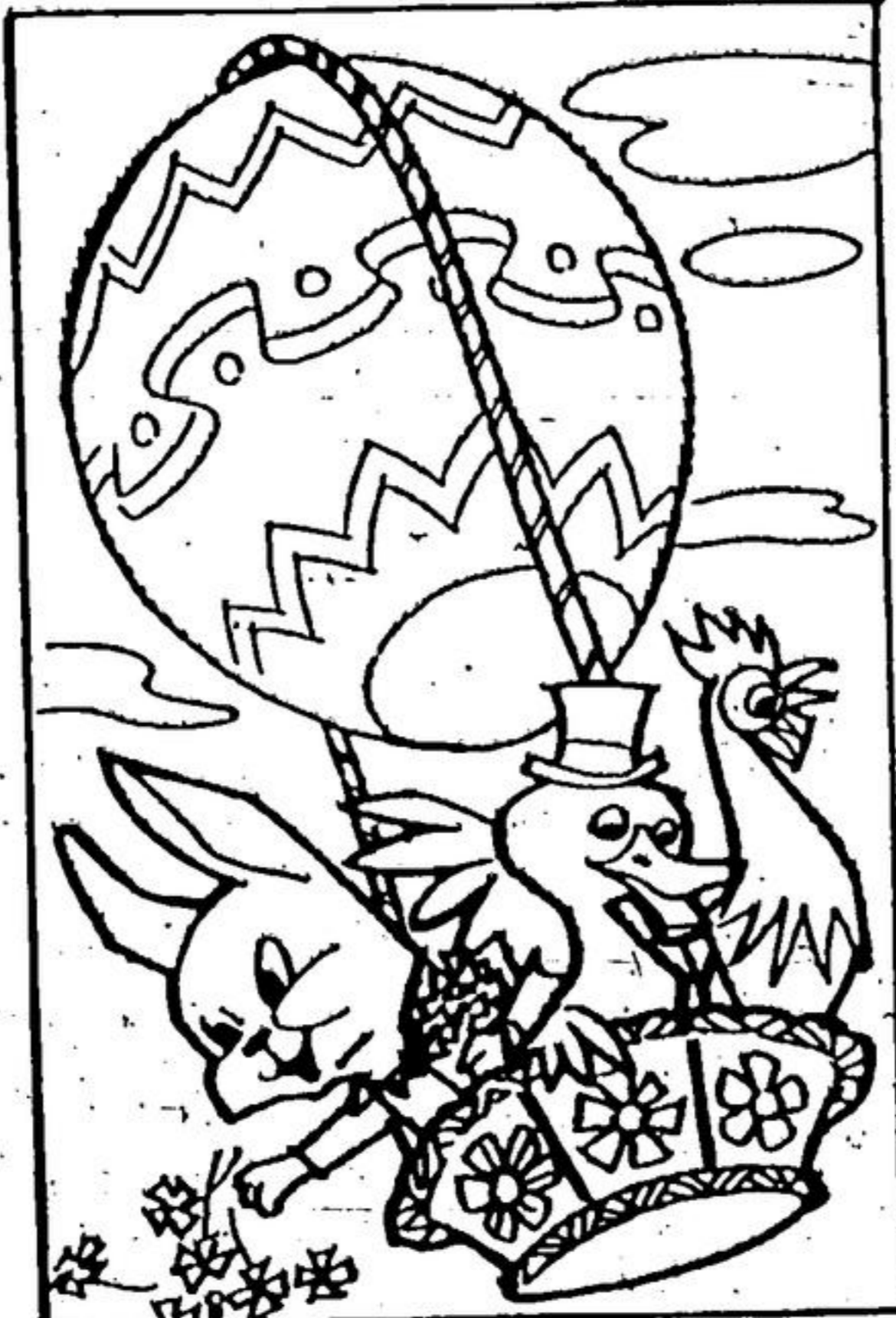
Taking off in his Easter balloon, the Bunny will visit you very soon.