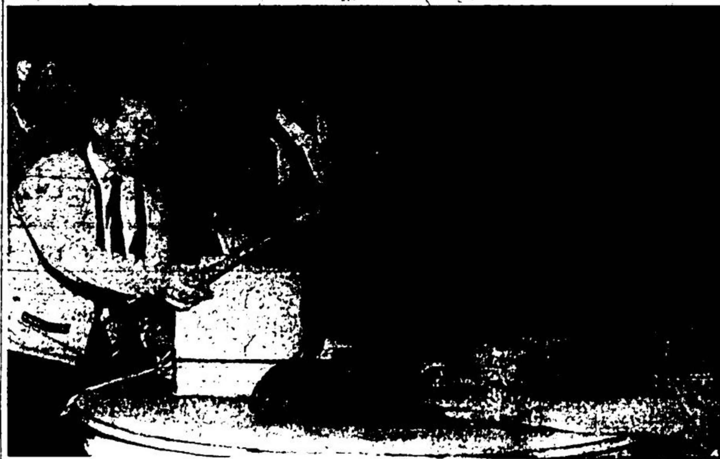
SCRATCH ONE BAT AND SPITBALL

GEORGETOWN MINOR BASEBALL Association share a laugh over some pieces of baseball equipment that were weeded out during some C.M.B.A. inventory last Thursday night. Prime reason for the meeting was to elect governors of a minor league baseball program here this season.