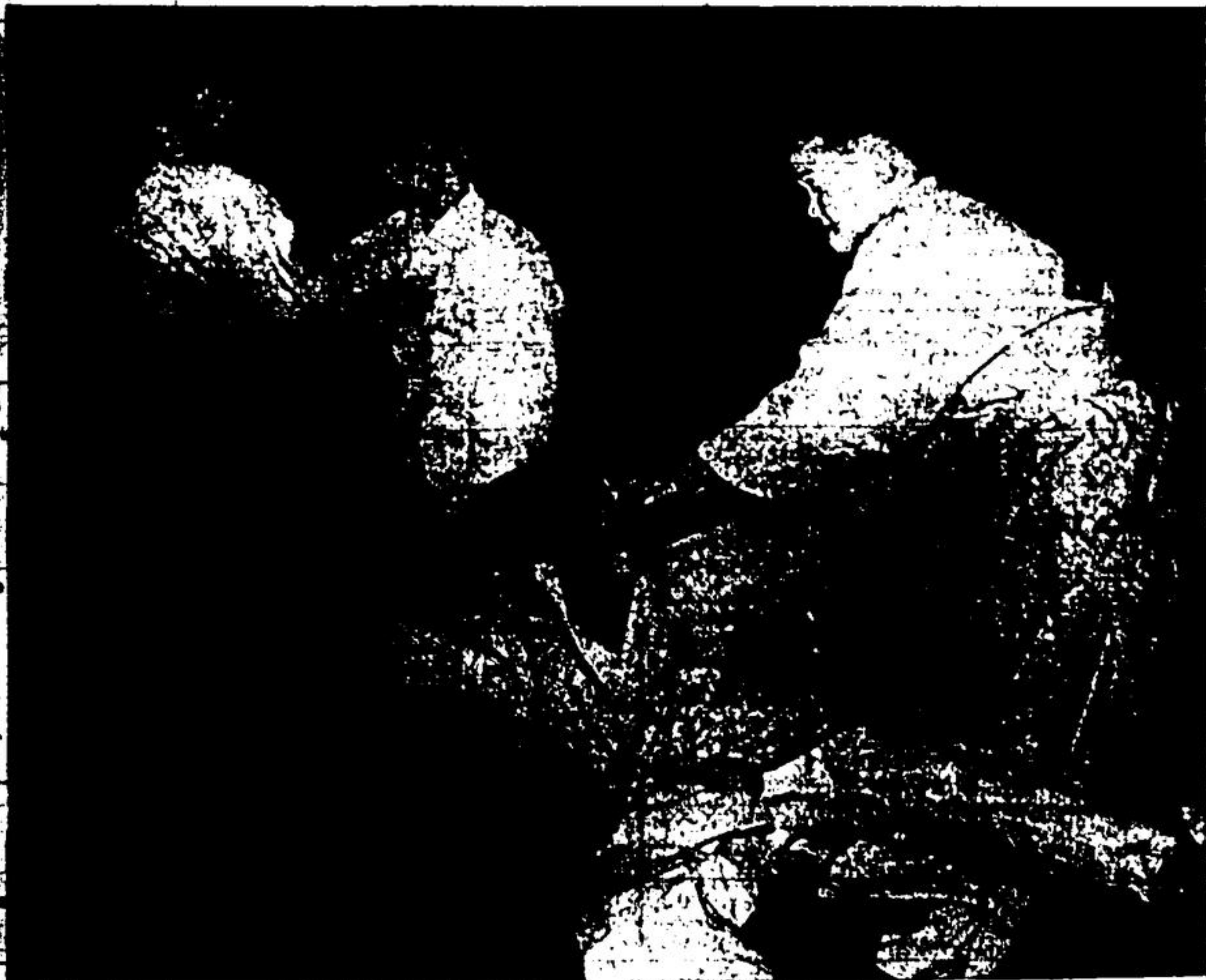
WEARING THEIR JUDO APPAREL, purposefully loose fitting so opponents have lots of clothes to get a grip on, the junior judo class demonstrated the rise and fall of a student of self defence.