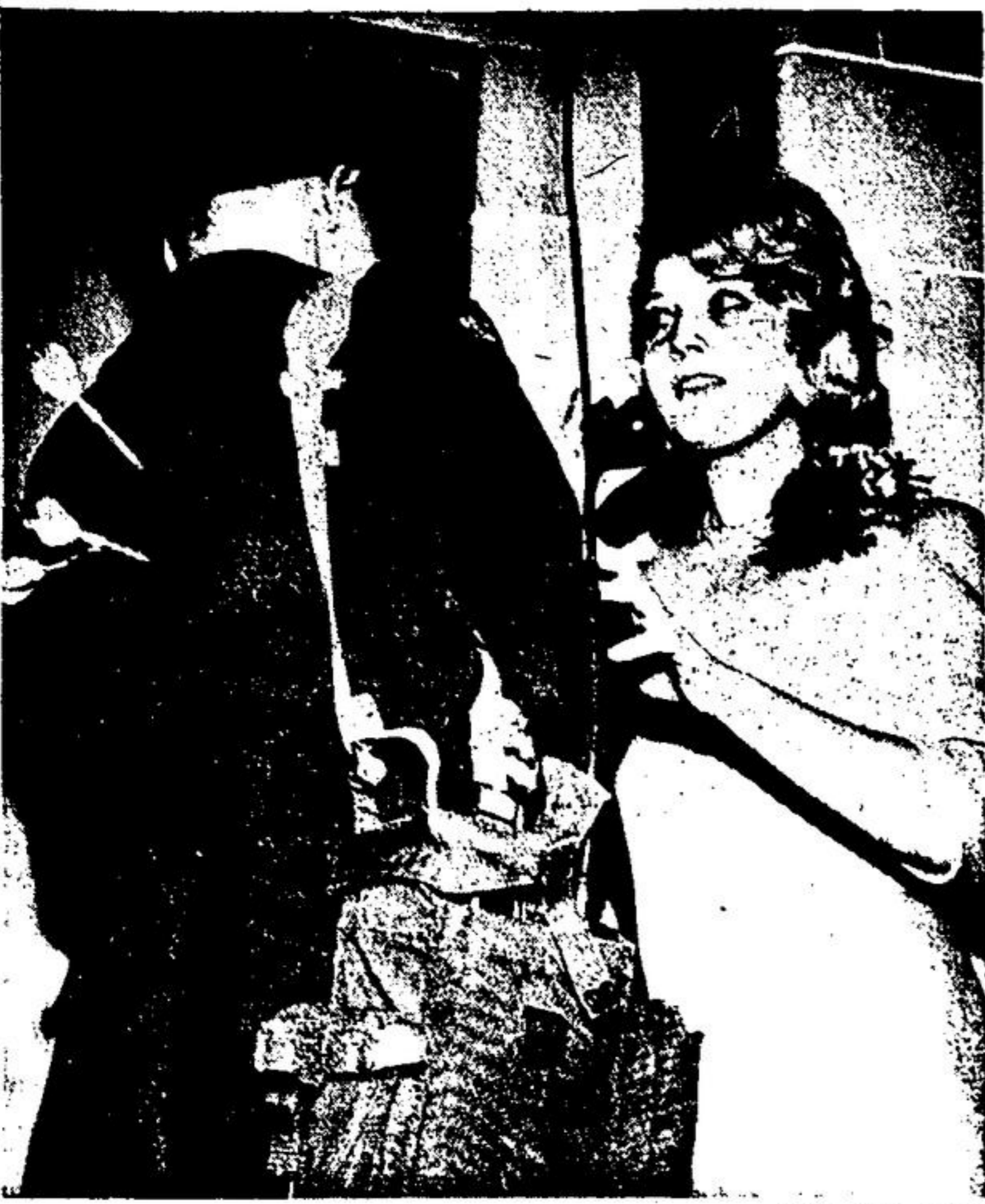
"THAT'S RIGHT DOCTOR, HE SAID THE PAINS CAME WHILE HE WAS OVER BY THE DART GAME"