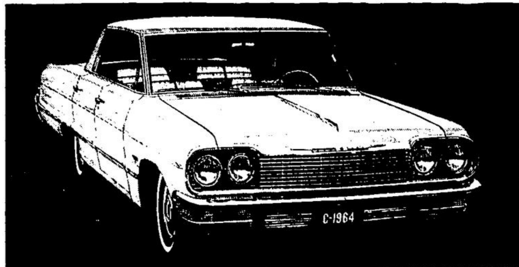
'64 Chevrolet Impala Sport Sedan — one of 15 Jet-smooth luxury Chevrolets.

Big luxury, big style, big room in the most luxurious CHEVROLET ever!