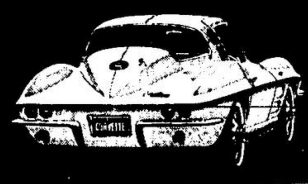
'64 Corvette Sting Ray Sport Coupe.

See five entirely different lines of cars at your Chevrolet dealer's