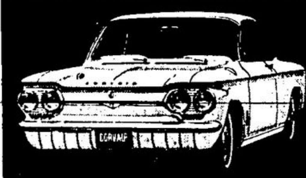
'64 Corvair Monza Club Coupe.

'64 CORVETTE! Major suspension refinements make Corvette ride more smoothly. New transmissions go with the four big V8s.