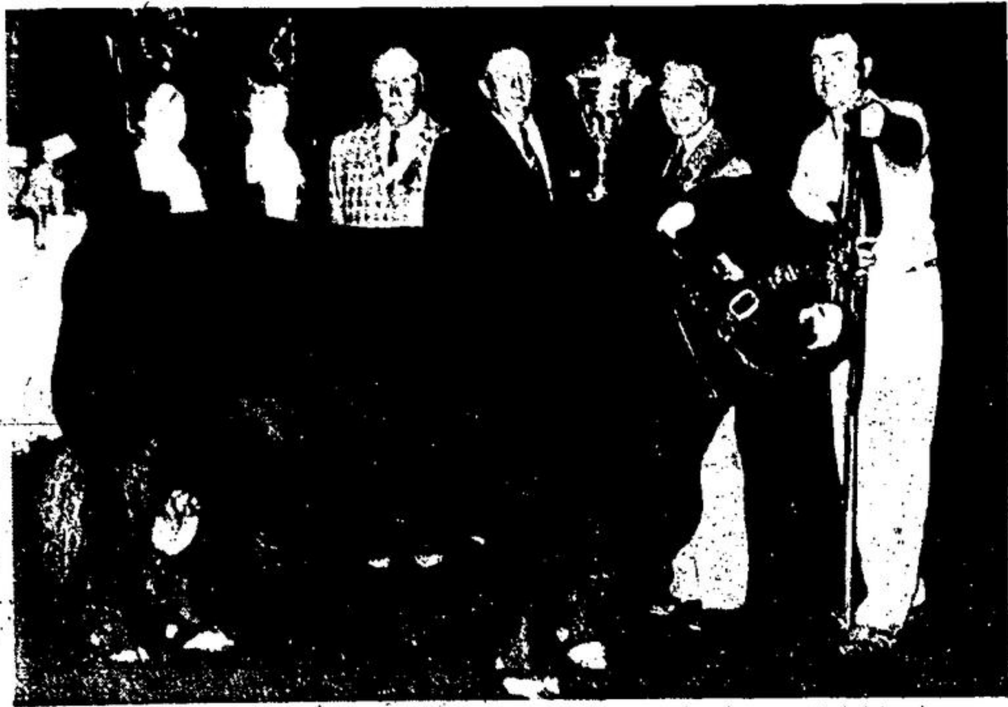
GEORGETOWN BULL GRAND CHAMP OF CNE