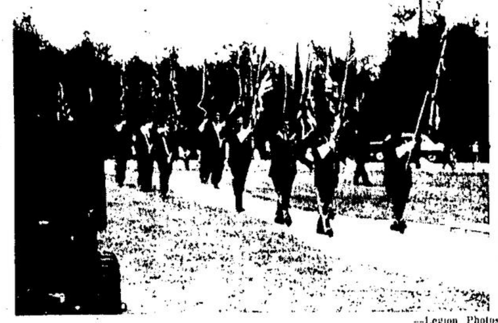
THE BRANCH 120 colour party approach the cenotaph.