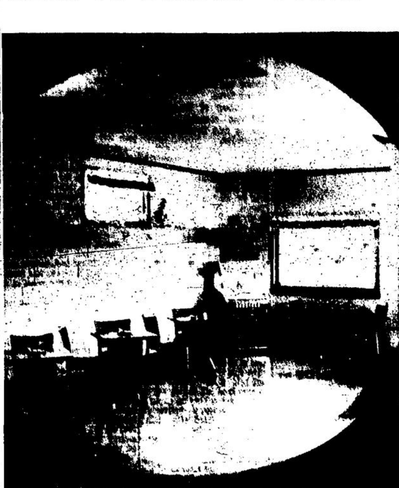
The new school building for the district is expected to be completed in the fall. The building will cater to young people in the district.

The new school building for the district is expected to be completed in the fall. The building will cater to young people in the district.