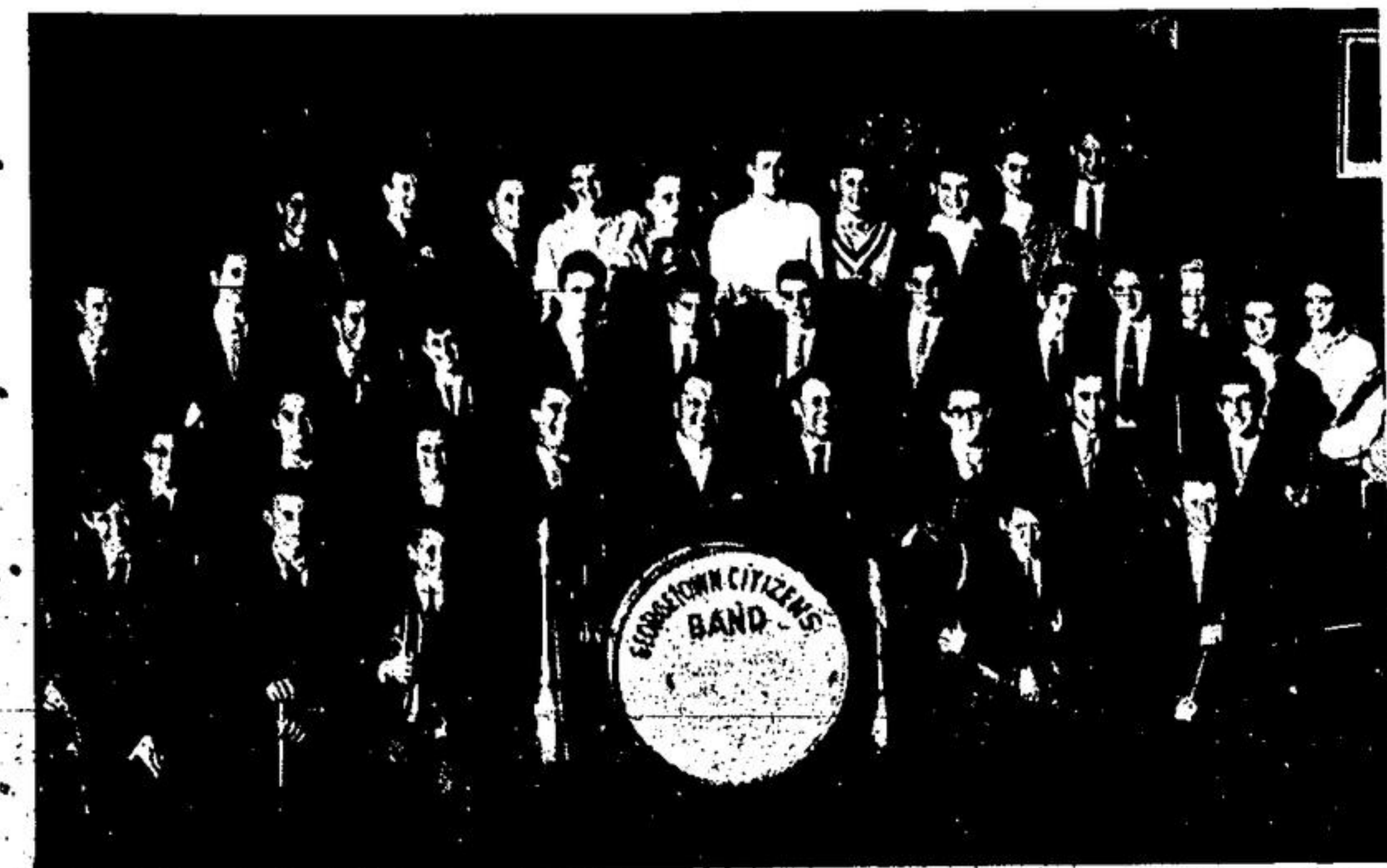
GEORGETOWN'S NAME BACK IN "EX" BAND COMPETITION

THE NAME GEORGETOWN which Canadian National Exhibition goes once held synonomous with the great Lorne Scots Military Bands of past years will return to the list of bands competing at the Ex. this year, and if the preparations are any kind of a yardstick the town could regain much of its past reputation as a music centre on the first try.