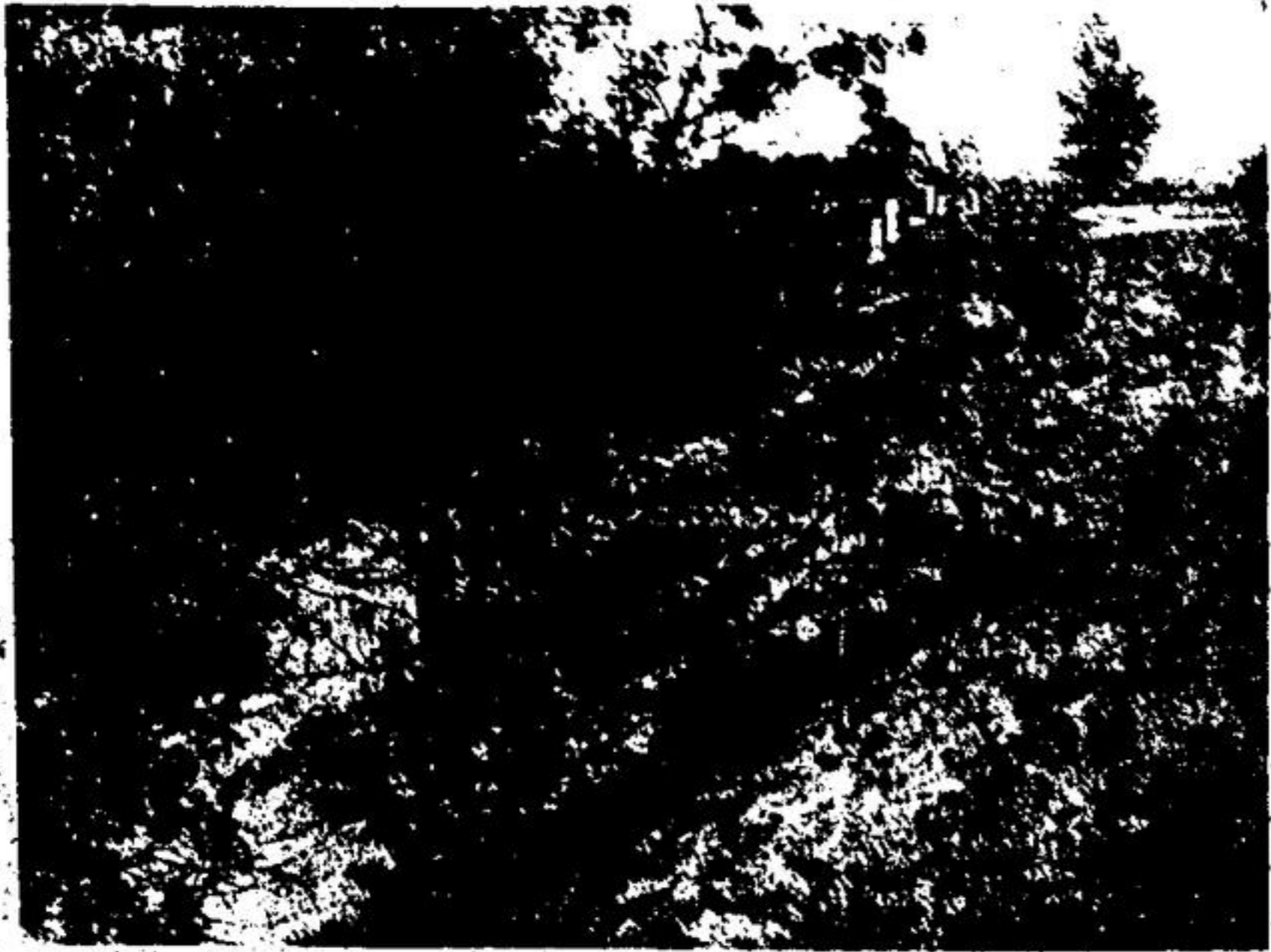
THE STEEP SLOPE in the foreground has been edging closer to the graves in Glen Williams Cemetery for years because of erosion at the base of the sandy cliff and the situation has reached the serious stage. The Credit River tributary, at the base of bank is perpetually washing away the toe of the slope and the sand is shifting to compensate for it. The Esquimaux Township Council, Glen Williams Cemetery Board and Credit Valley Conservation Authority are all naturally concerned.