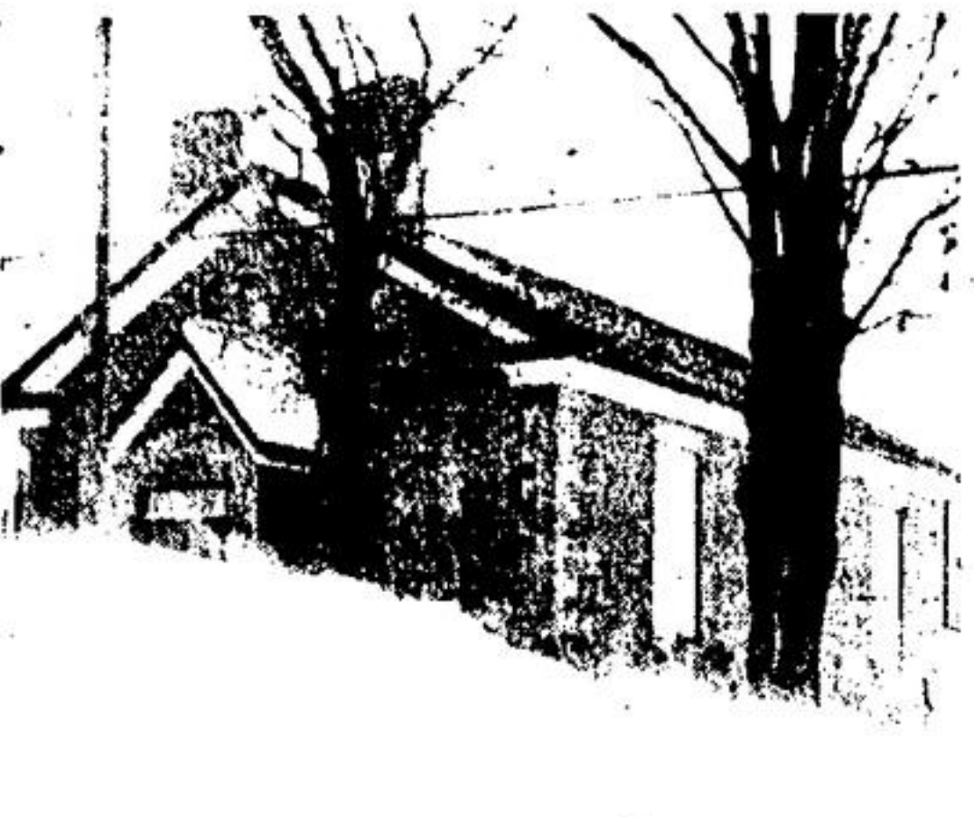
BLUE MOUNTAIN, near Ballinacree, heard the laughter of school children for the last time in June, 1962.