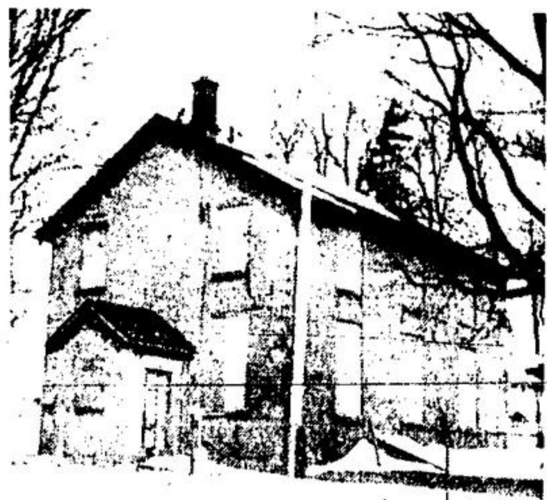
GIBRALTAR, on the 5th Line north of Limhouse, became obsolete at the end of the term.