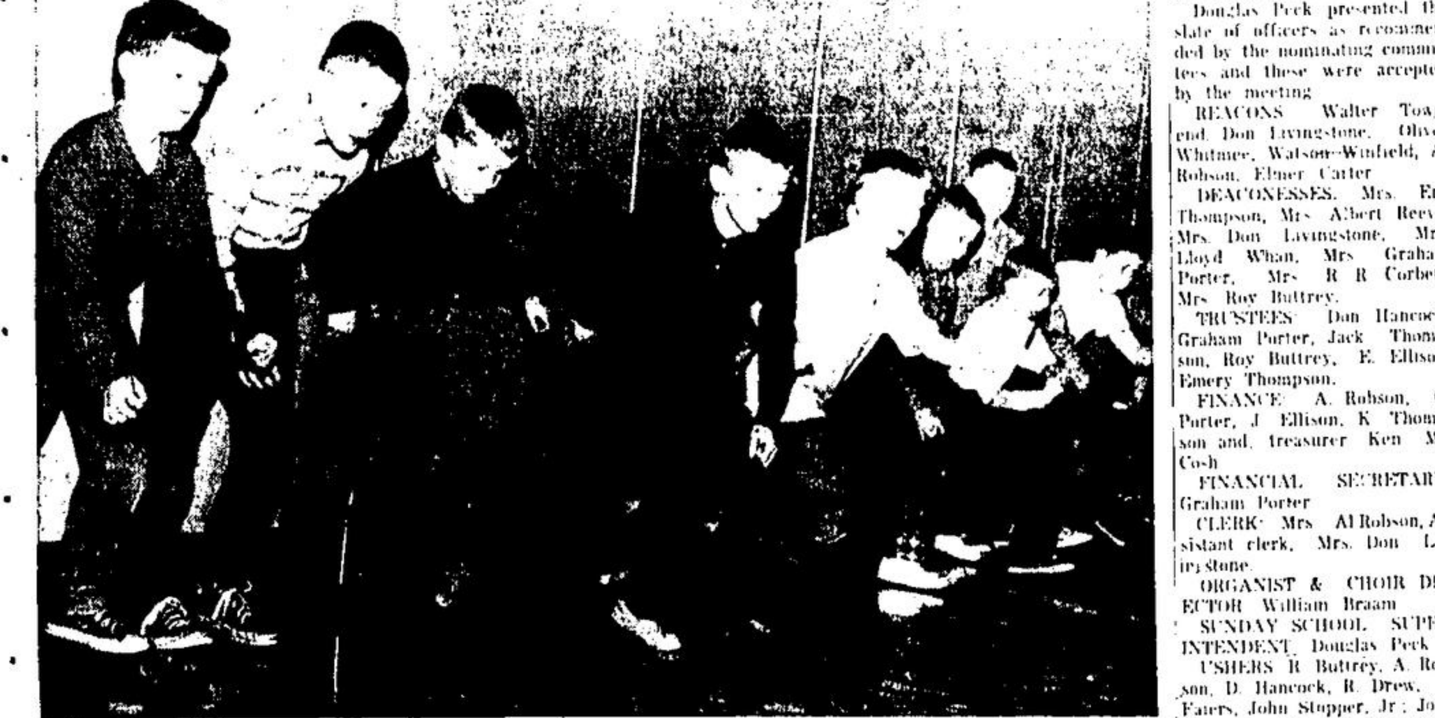
HEALTHY BODIES AS WELL as healthy minds are products of the programs now going on. Above some of the boys of the junior group (8 and 9 year olds) are away on a stop and start race across the gym floor. There are 66 boys enrolled in the gym classes.

Where the latter is germs are not allowed to thrive. Where there is the 'Y', juvenile delinquency is kept down. Georgetown, in the late fall, became a 'Y' town. The initial program included gym classes for boys and girls from 8 to 11 years and they are now operating smoothly under well-qualified supervision. Above, some of the 55 girls enrolled in the program are introduced to volleyball at the high school gym where the groups meet every Thursday night.