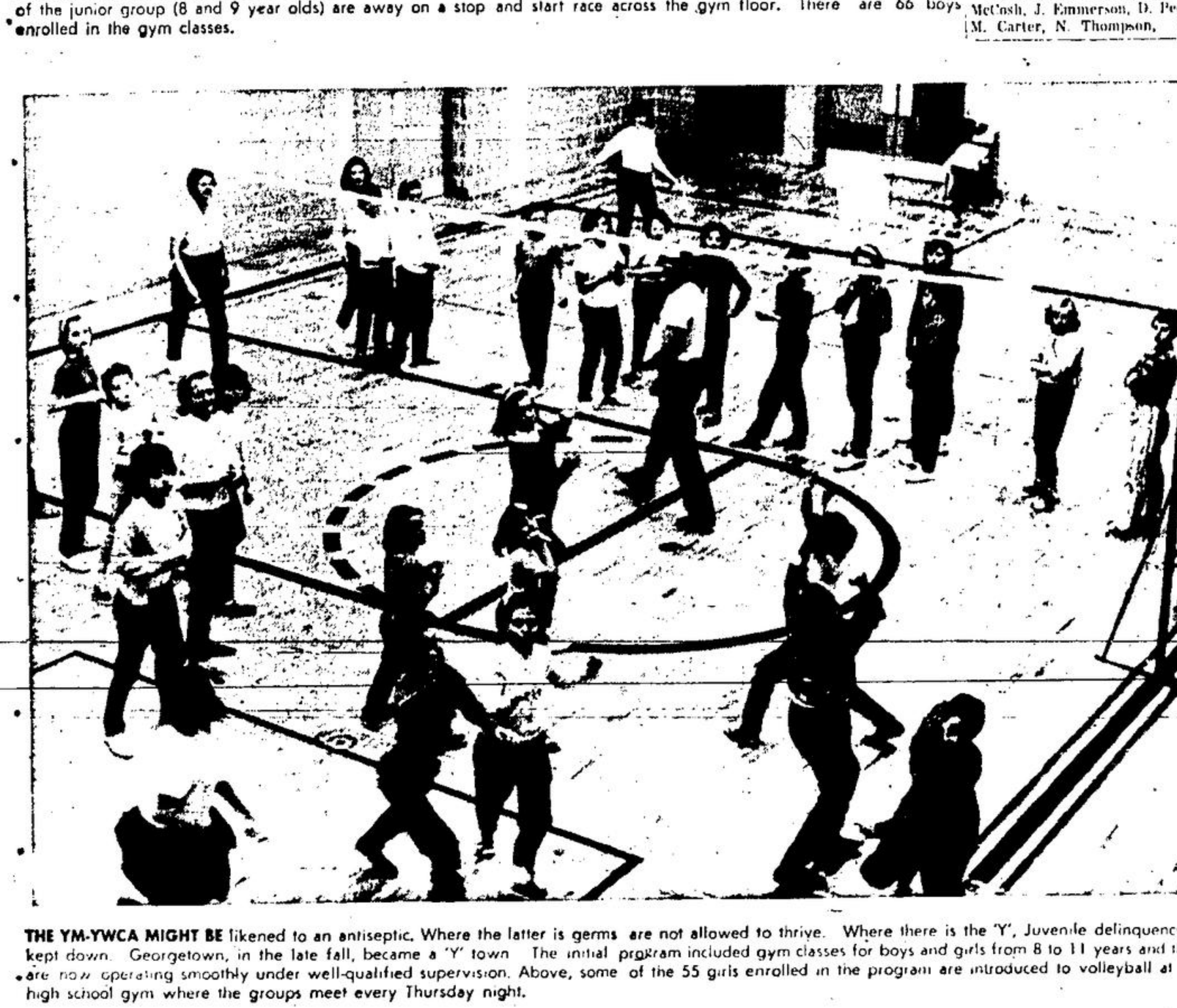
THE YM-YWCA MIGHT BE likened to an antiseptic. Where the latter is germs are not allowed to thrive. Where there is the 'Y', juvenile delinquency is kept down. Georgetown, in the late fall, became a 'Y' town. The initial program included gym classes for boys and girls from 8 to 11 years and they are now operating smoothly under well-qualified supervision. Above, some of the 55 girls enrolled in the program are introduced to volleyball at the high school gym where the groups meet every Thursday night.