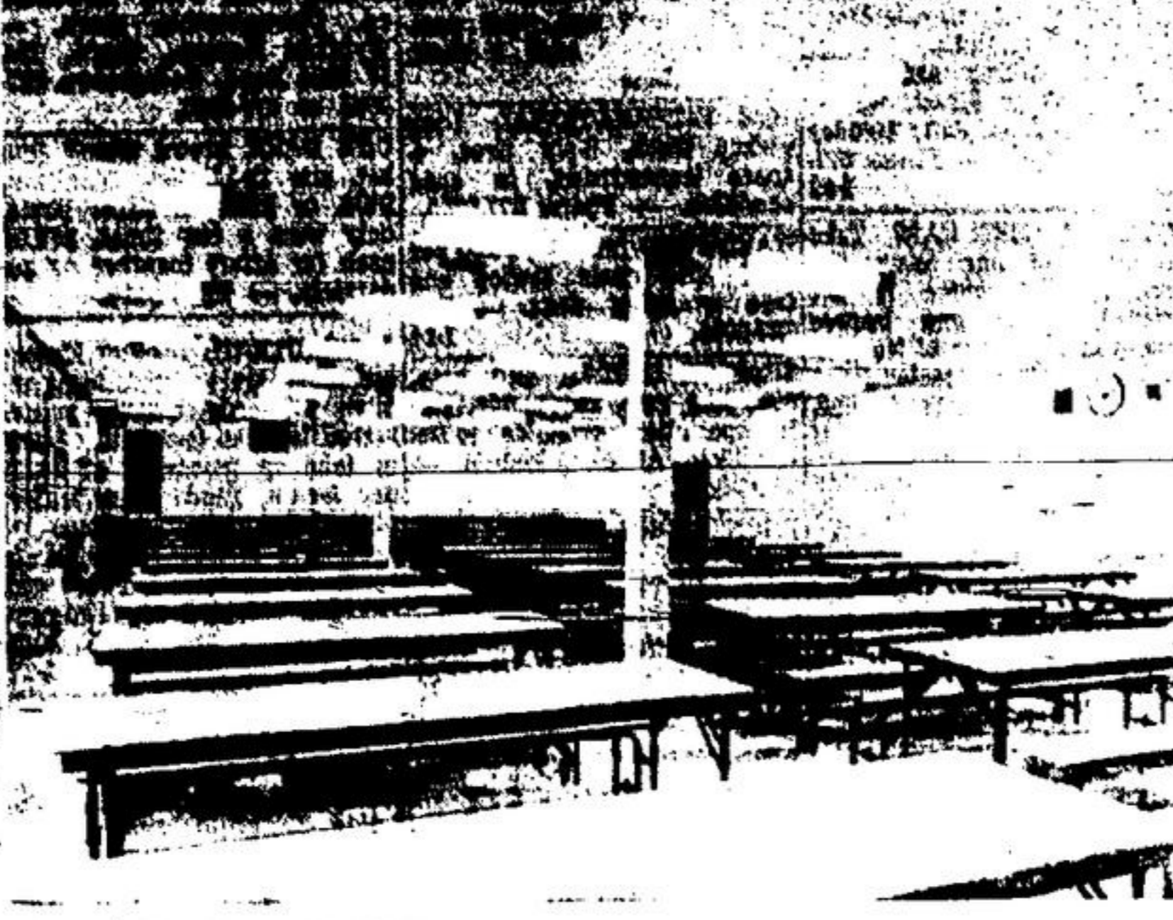
LIFT THE LID OFF SCHOOL KITCHEN, CAFETERIA