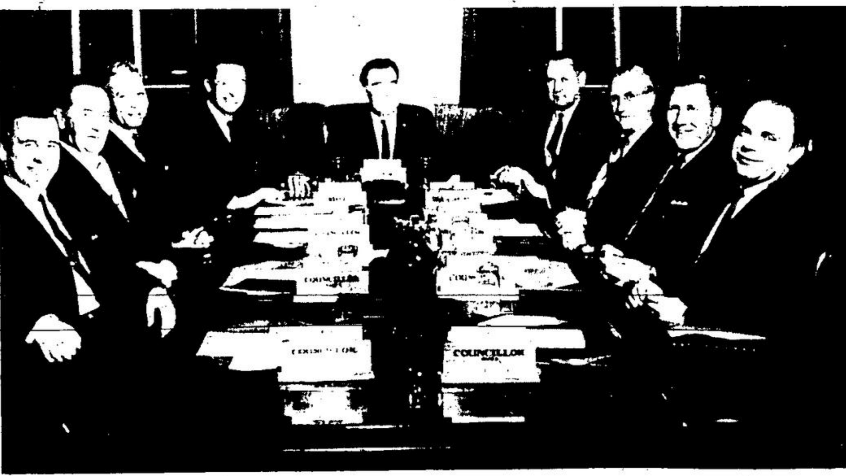
COUNCIL CONVENS FOR 1963 INAUGURAL

Twenty-two Georgetown industries produced goods valued at $18,352,625 in 1959 according to figures just released by the 1962 edition of the Canada Year Book. The latest available figures, though three years behind, show the town's industries employed 1,290 and had an annual payroll of $5,516,129.00.