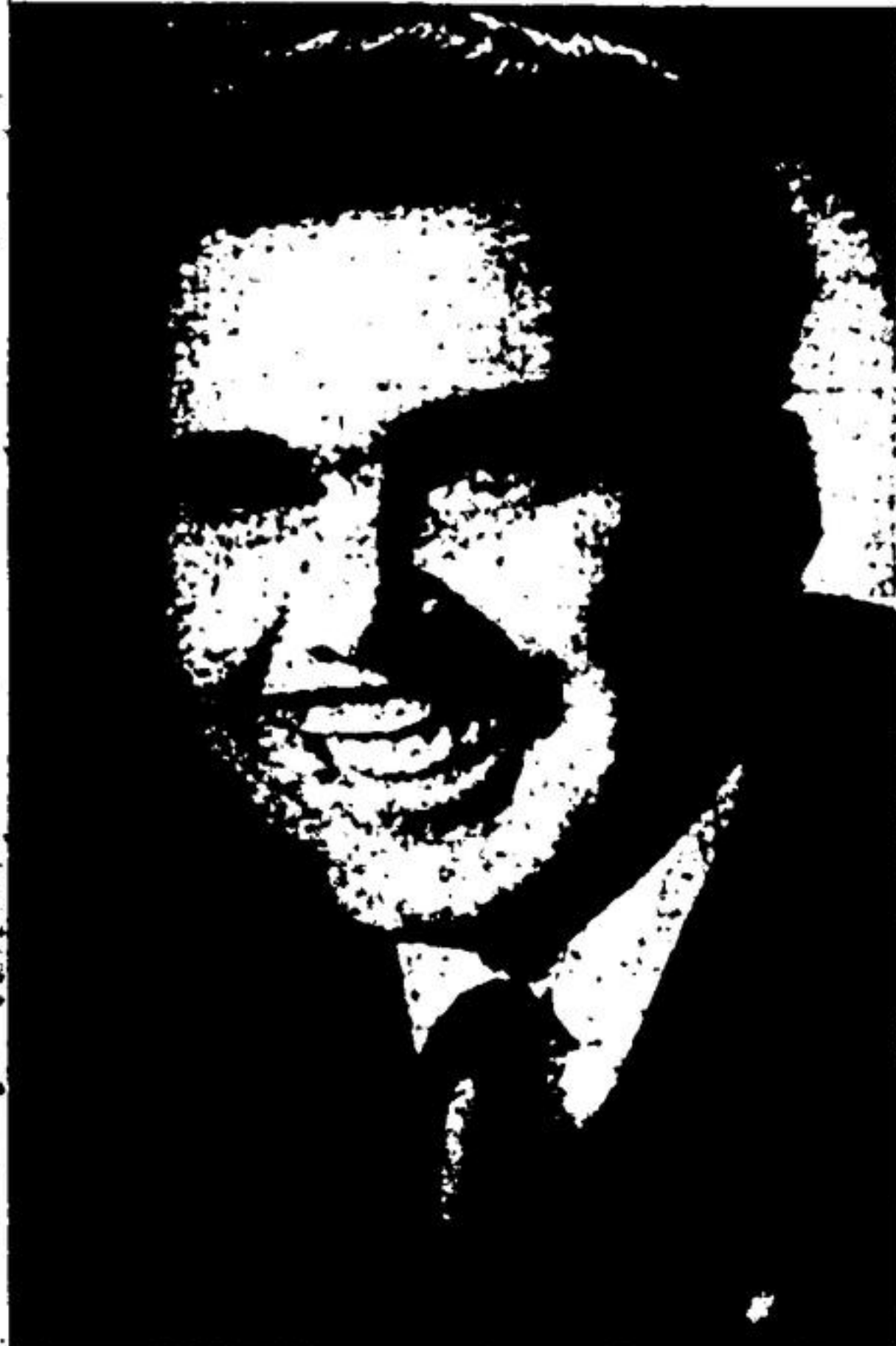
MAYOR E. Y. 'ERIN' HYDE Won in three-man race