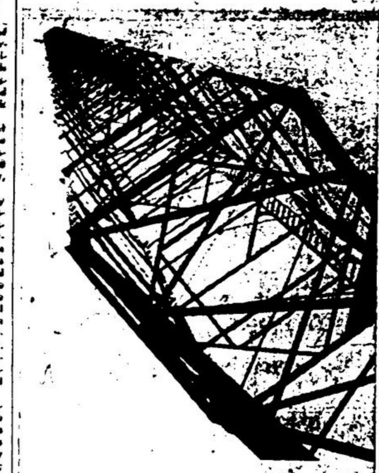
THIS IS THE TOWER itself from the base. It is 650 feet high, 200 feet higher than the Bank of Commerce Building in Toronto.

The members attending showed a great deal of enthusiasm and interest to get on with the job of building a strong new Democratic Party here in Halton.