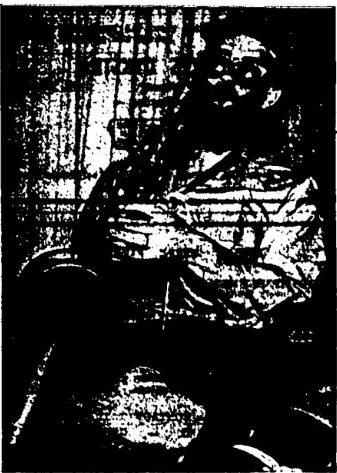
ALAN (FIDEL CASTRO) HARKNESS got a lot of the laughs. Like the character he represents, Alan too can blow up a storm, but with a sax.