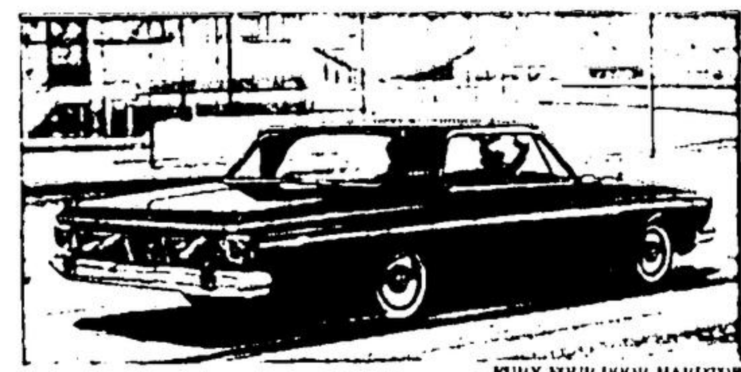
PURLY FOUR DOOR HARDTOP

Ask your Plymouth dealer for details of the new 5-year or 50,000-mile power-train warranty.