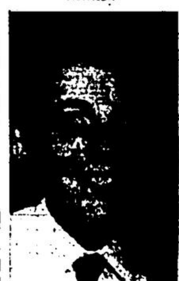
ROGER SMITH Chapel