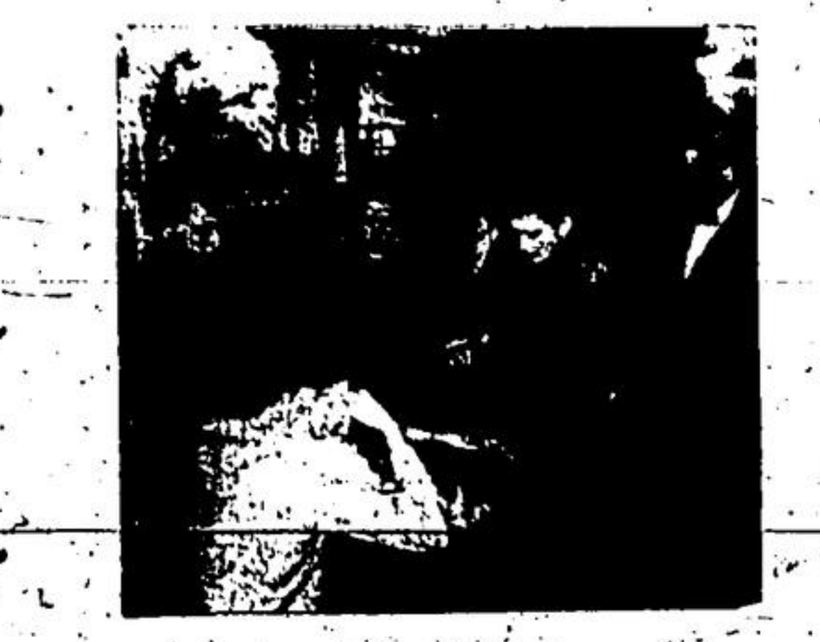
CHECKMATE The Chess club is now in its second year, and is one of the most active clubs in the school.