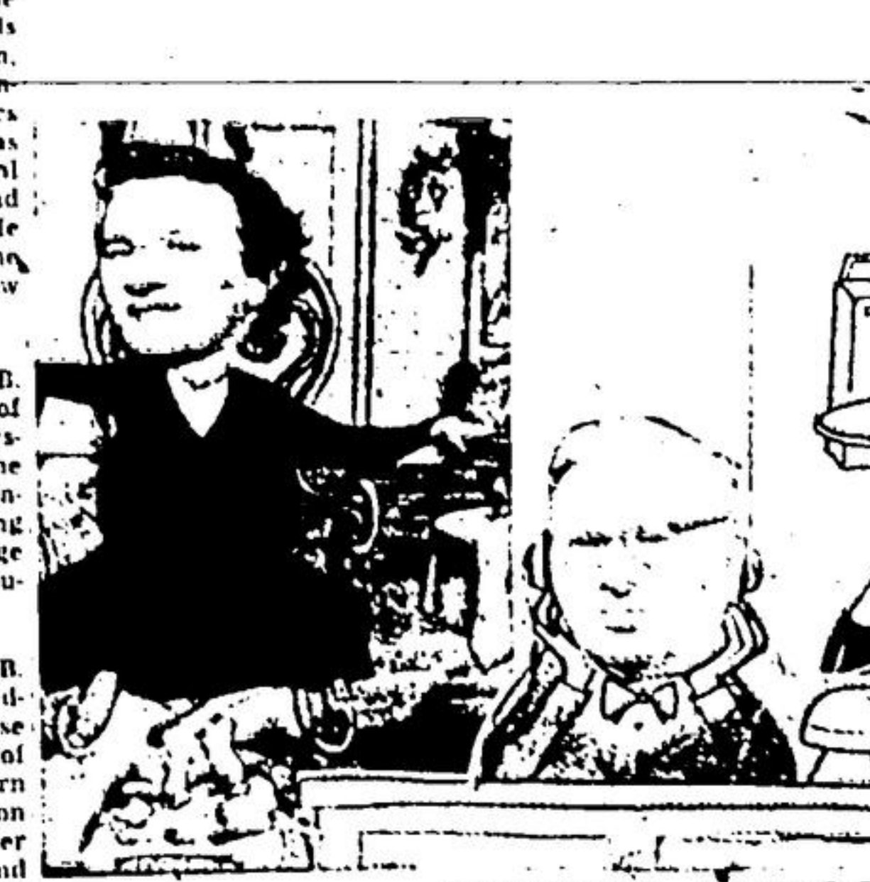
TEACHERS LAMPOONED Members of the teaching staff become cartoon characters in a section captioned 'Rogues' Gallery' where students take a good natured poke at their tutors with pencil and scissors. The above is just a sample.