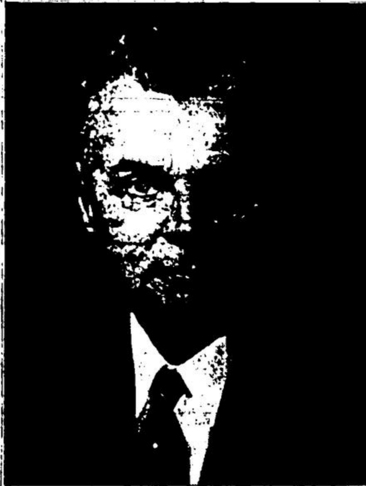
The Man For ALL Canada