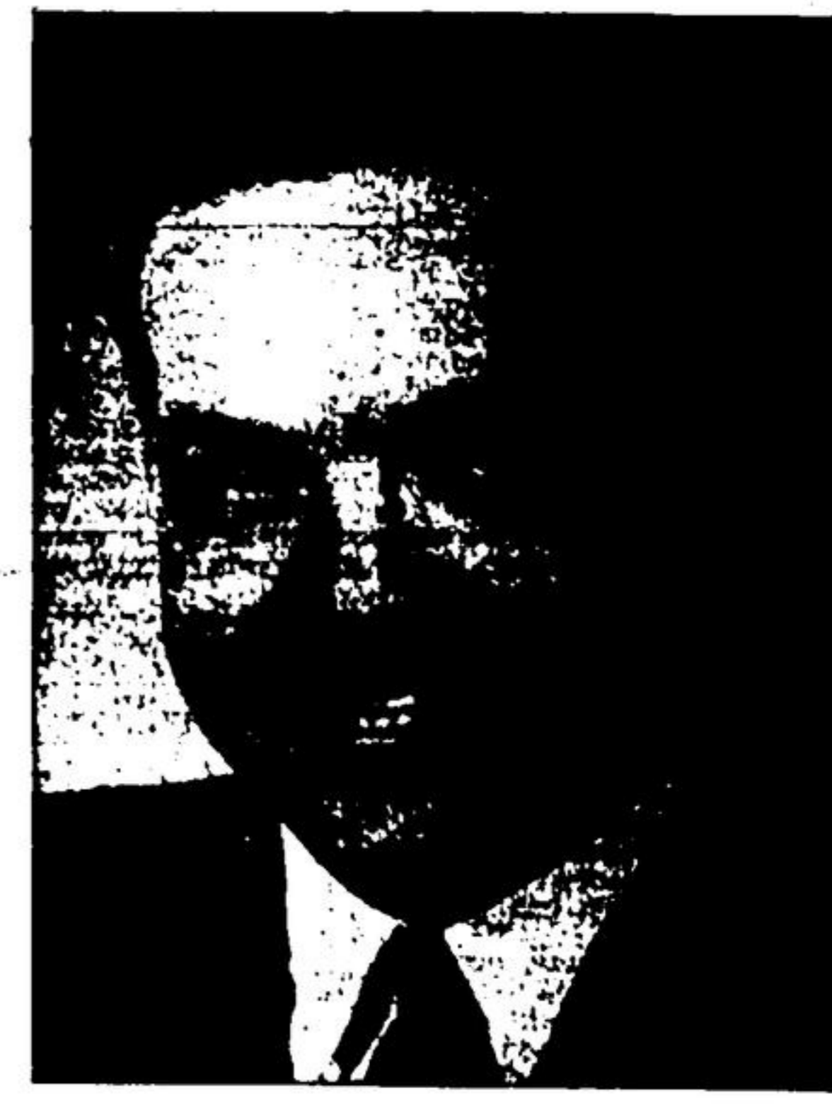
The Man For YOUR Riding

Issued by the Progressive Conservative Party