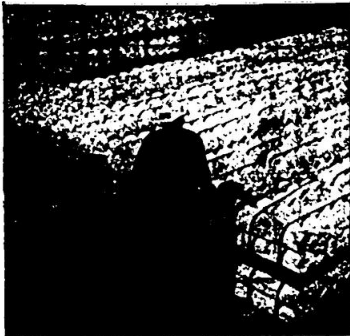
When loaded, the NPD reactor contains about 30 tons of uranium dioxide made up of 1188 bundles, each of which is some 20 inches long and contains close to 33 pounds of the fuel. Shown in this picture are packaged fuel bundles at the Nuclear Power Demonstration Station before being loaded into the reactor.