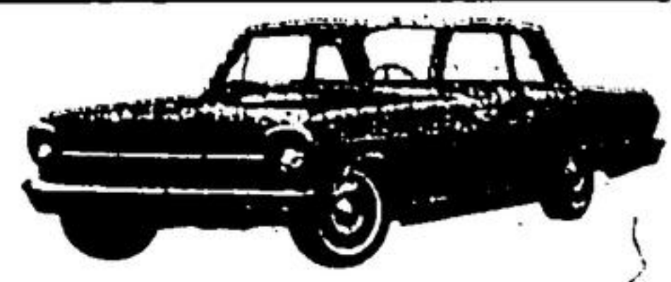
CHEVY II Nova 400 2-Door Sedan

CHEVY II... LIVELY LUXURY AT LOW, LOW COST