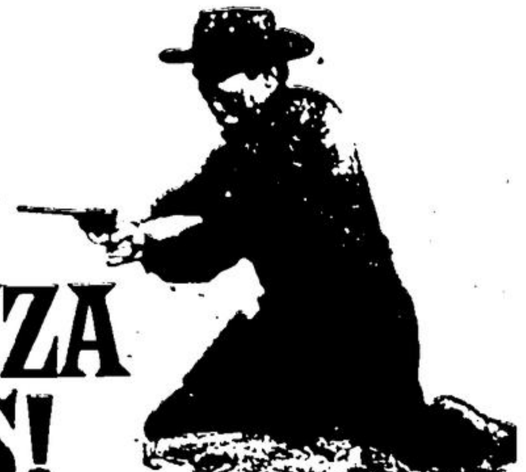
PERNELL ROBERTS AS 'ADAM'