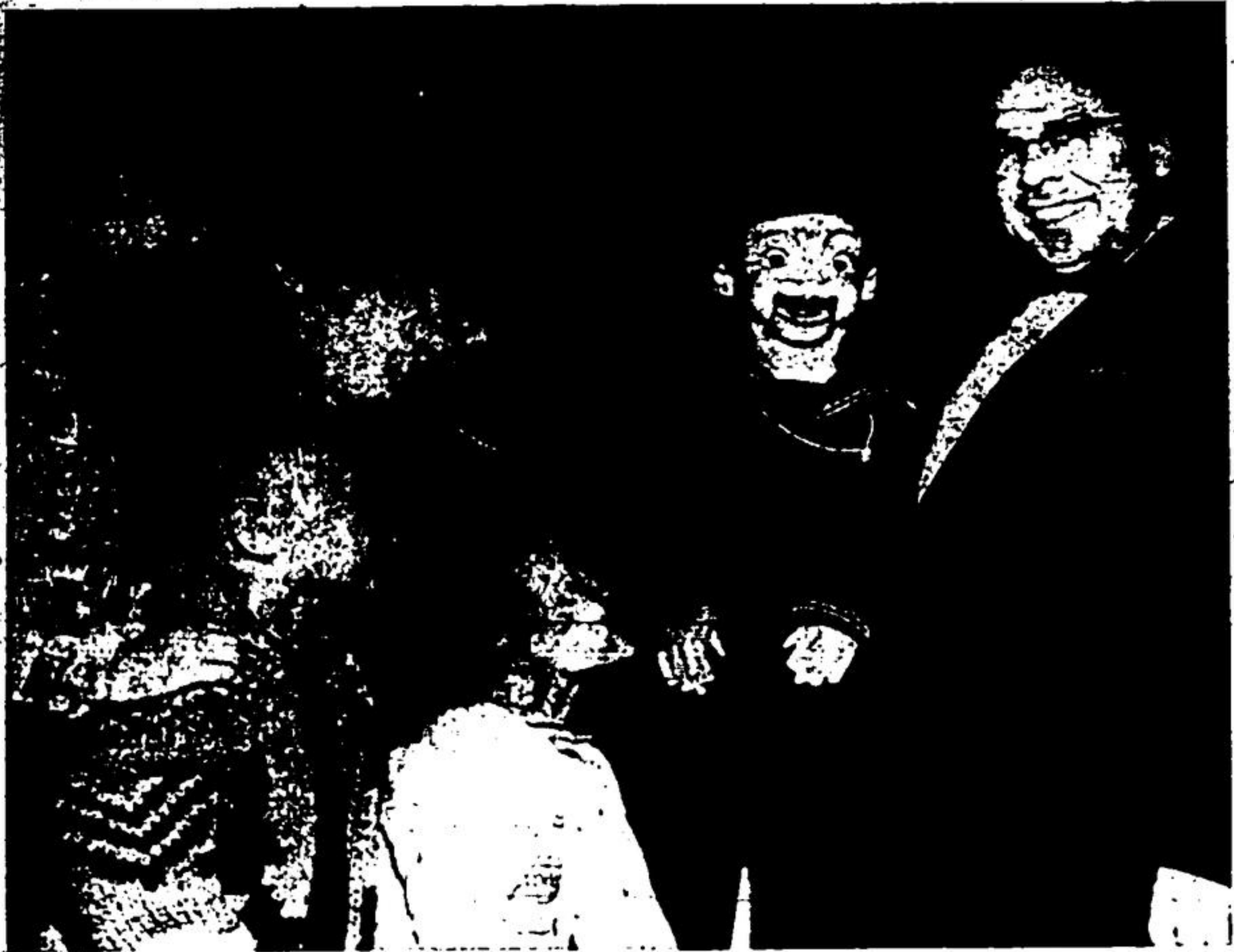
A PAIR OF PIED PIPERS