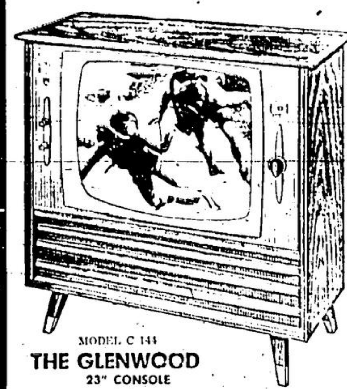
MODEL C 144 THE GLENWOOD 23" CONSOLE

Regularly Selling at $359.95 NOW ONLY $259.95 W/T