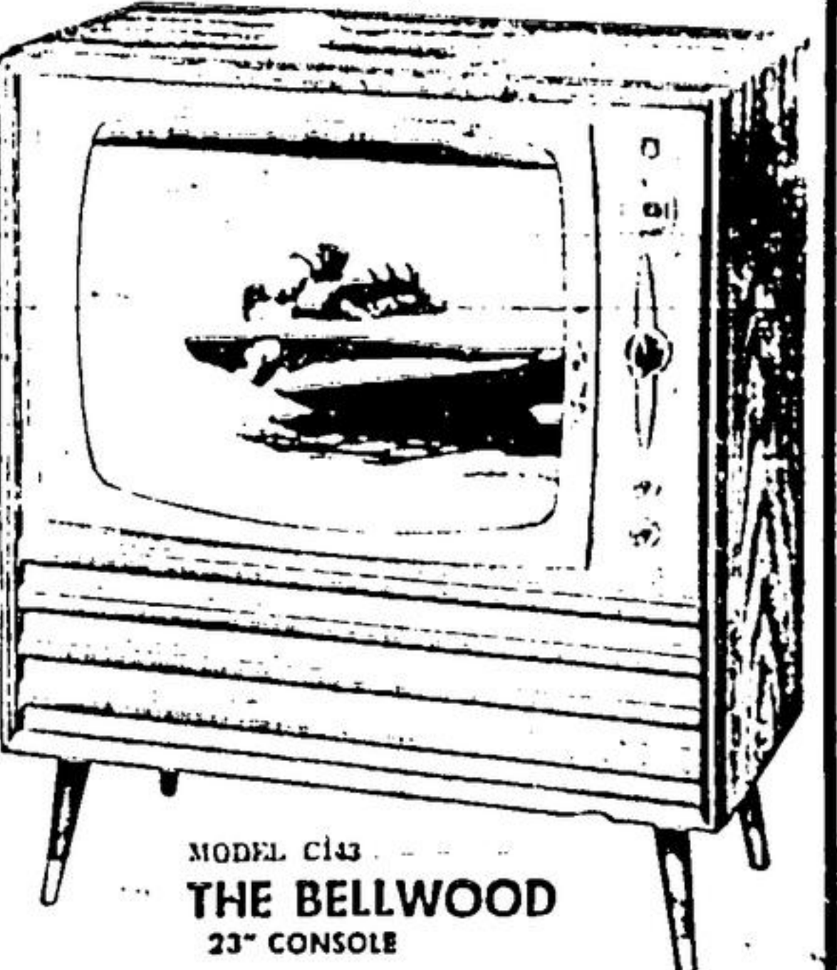
MODEL C143 THE BELLWOOD 23" CONSOLE

Sound and picture quality are unmatched for clarity and fidelity. Picture tube has bonded safety glass that ends dust problems, gives sharper reflection free pictures. All wood cabinet is available in beautiful modern finishes of Contemporary Oiled Walnut and Light Walnut. Automatic picture-size control keeps pictures from shrinking or fading with change of voltage in home electrical systems. Exceptional sound from 6" duocone speaker. Double interference filters. Long distance electronic tuner. Precision etched tuner coils won't warp or burn out.