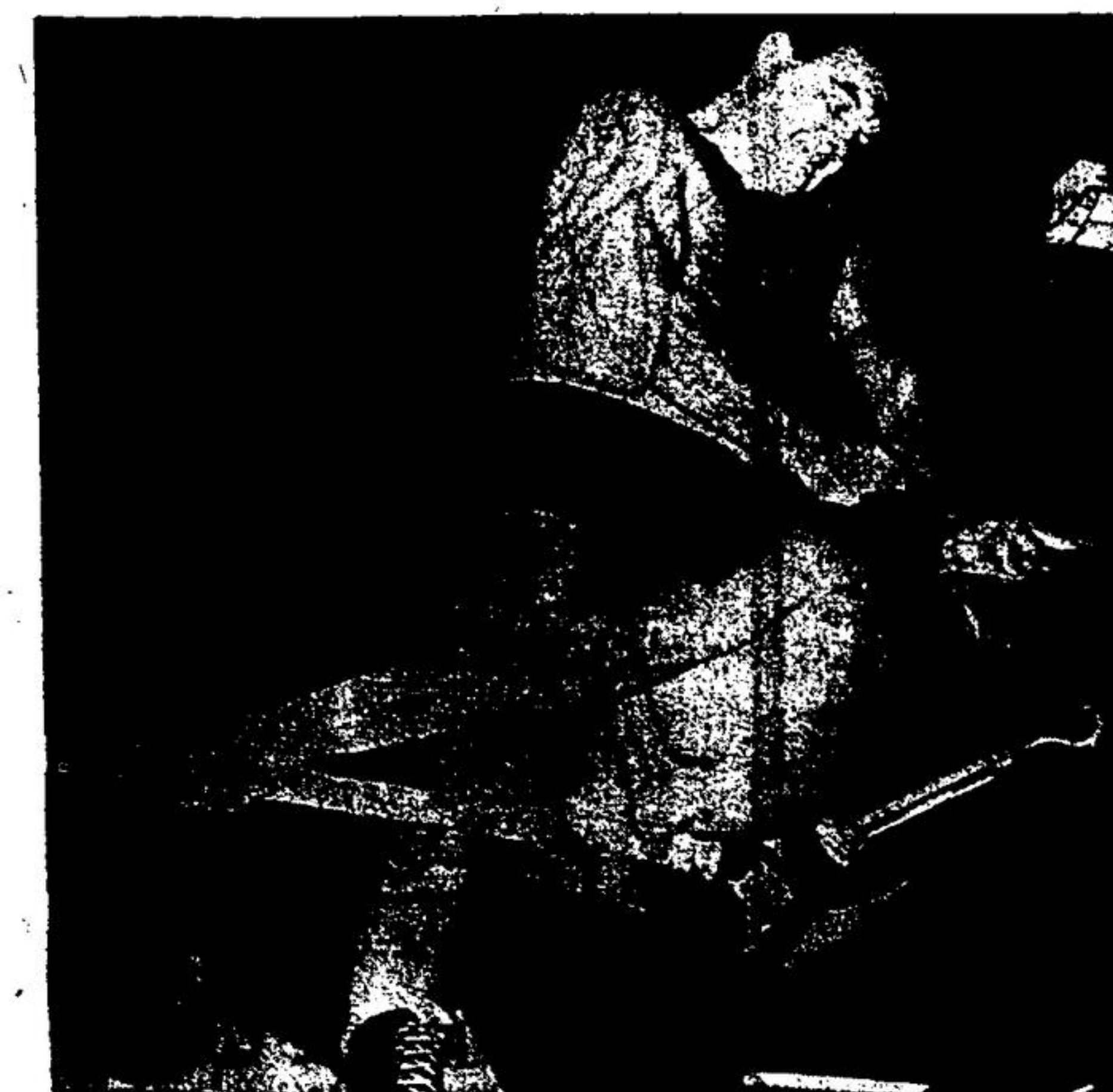
JULY '61 - Whipper Billy Watson retains title in British Empire championship match with Stan Sitsiak at Memorial Arena.