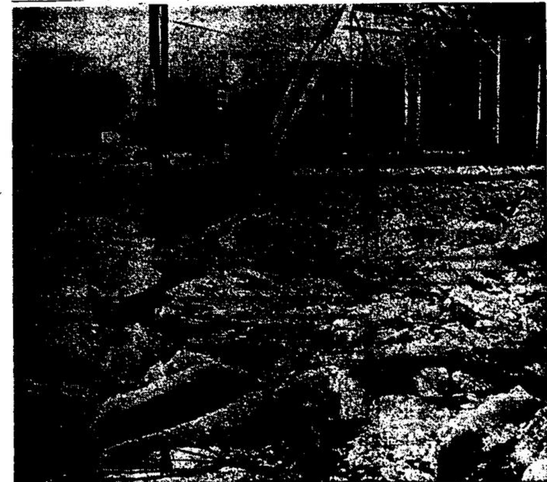
FEBRUARY '61 - Ice jams up at Glen bridge and later heaves into streets in flood.