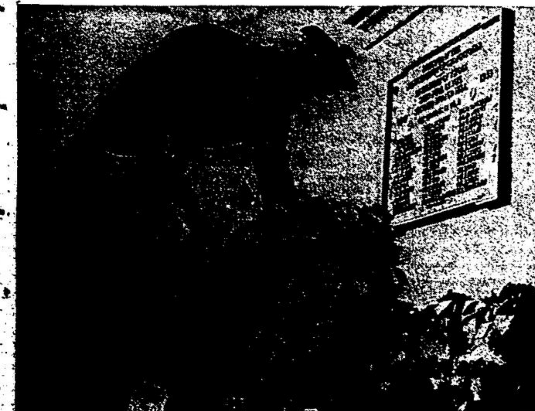
SOLEMN SERVICE held at cenotaph in memory of war dead.