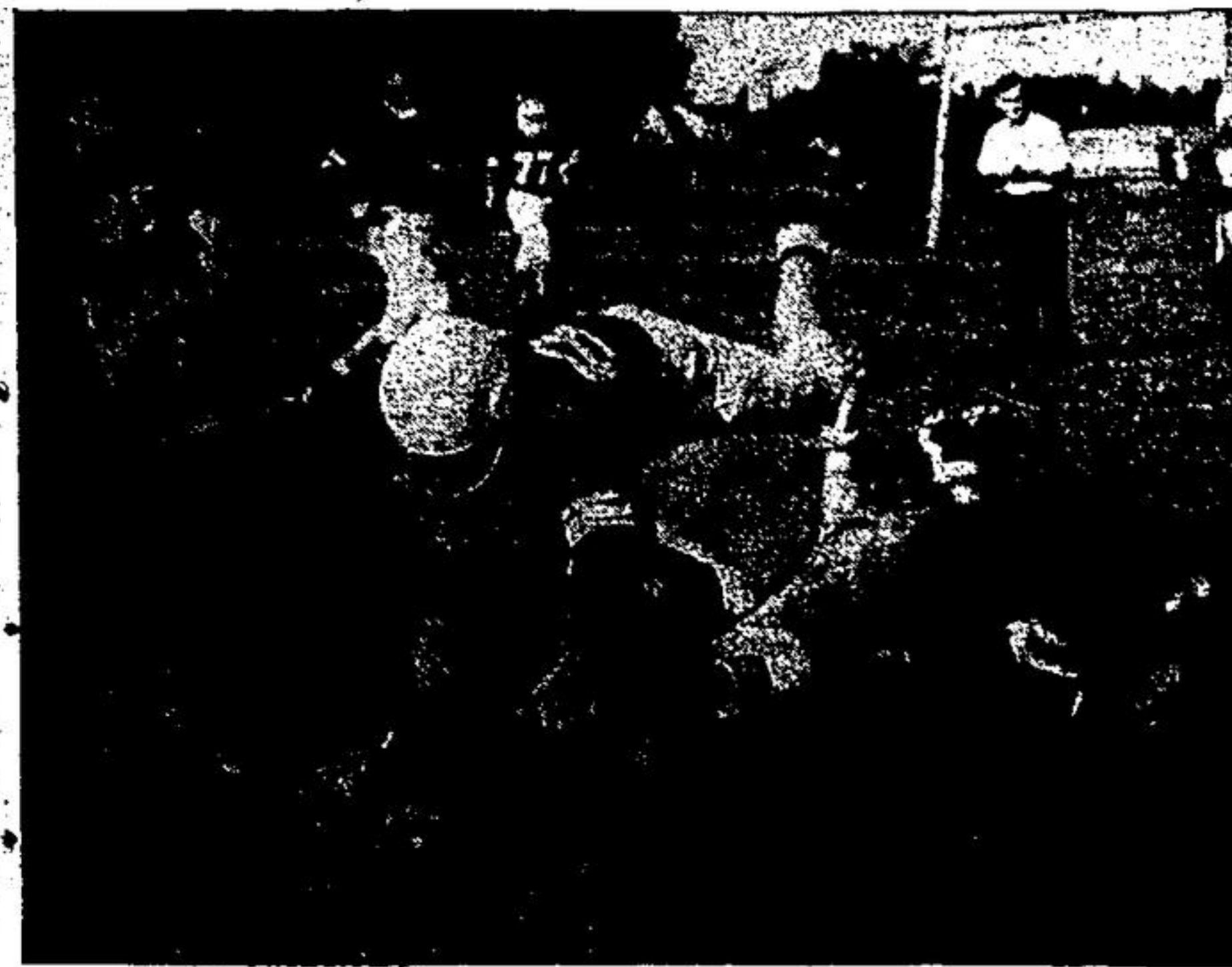
GEORGETOWN High School football team begins most successful season in years.