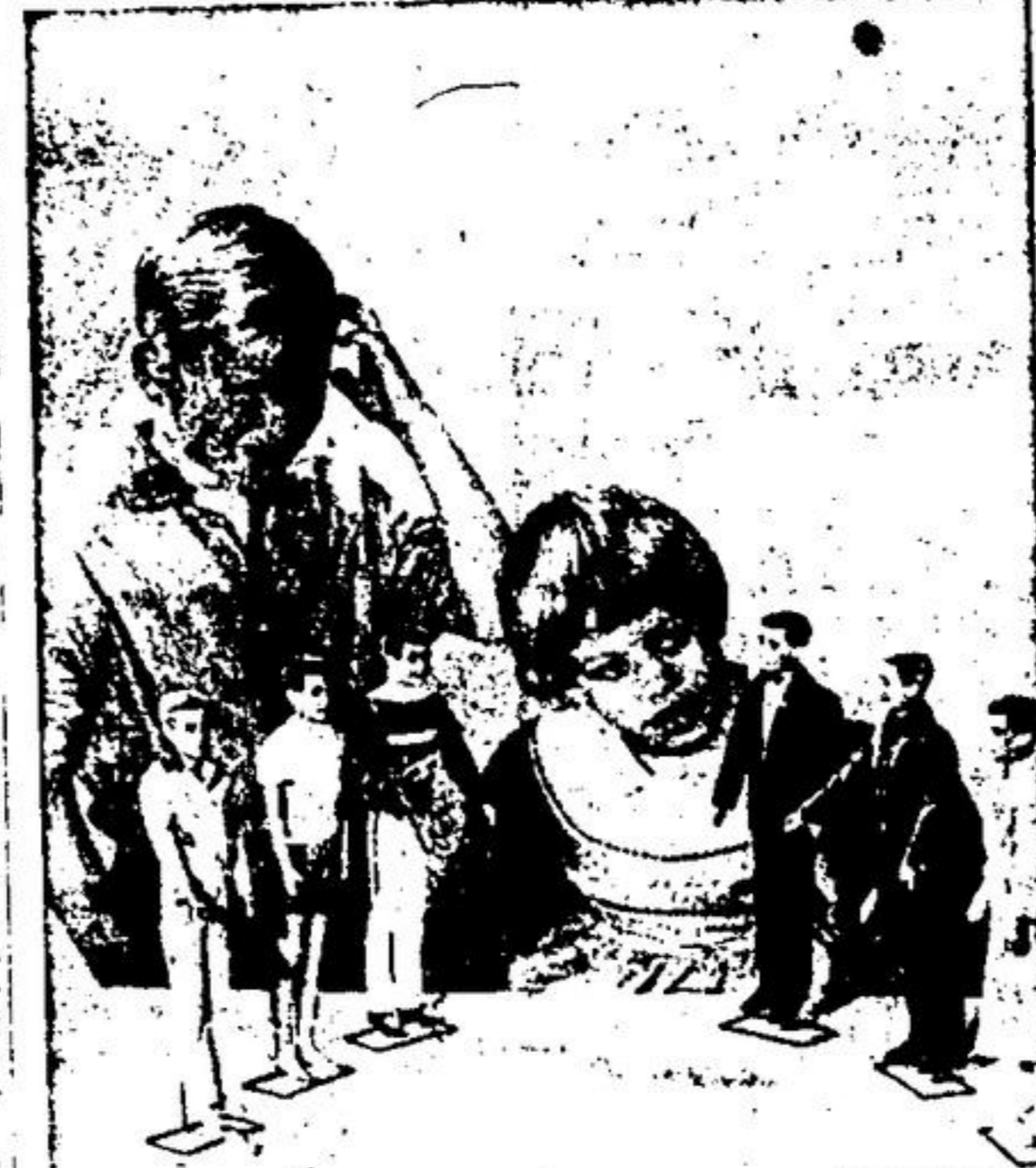
MIXED REACTIONS: The young lady seems pleased but the reaction of her young gentleman friend is a bit different. He isn't quite sure of his opinion regarding the new boy dolls on the holiday market this year as companion to more familiar girl-type dolls. "Well... if you like dolls..."

KEEP CHILDREN BUSY AS HOLIDAY NEARS Children get bored during the Christmas season. Sure, Christmas is a season of excitement for the young ones. The trouble is they get so excited waiting for Santa to come that they become impatient — and need something to occupy their time. The wise mother will give them something to do. Children enjoy making things with their hands. They are anxious to help decorate the house and the tree. Many parents brush them aside, saying "You are too little"