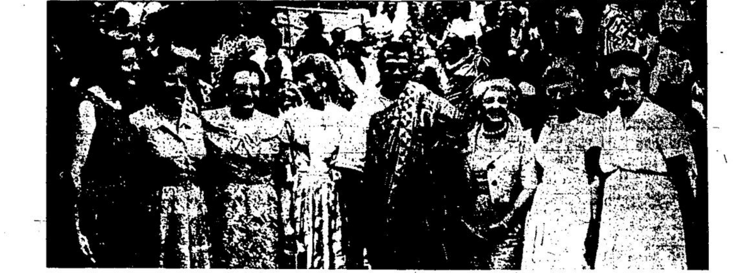
GEORGETOWN B & P MEMBER IN GHANA DELEGATION