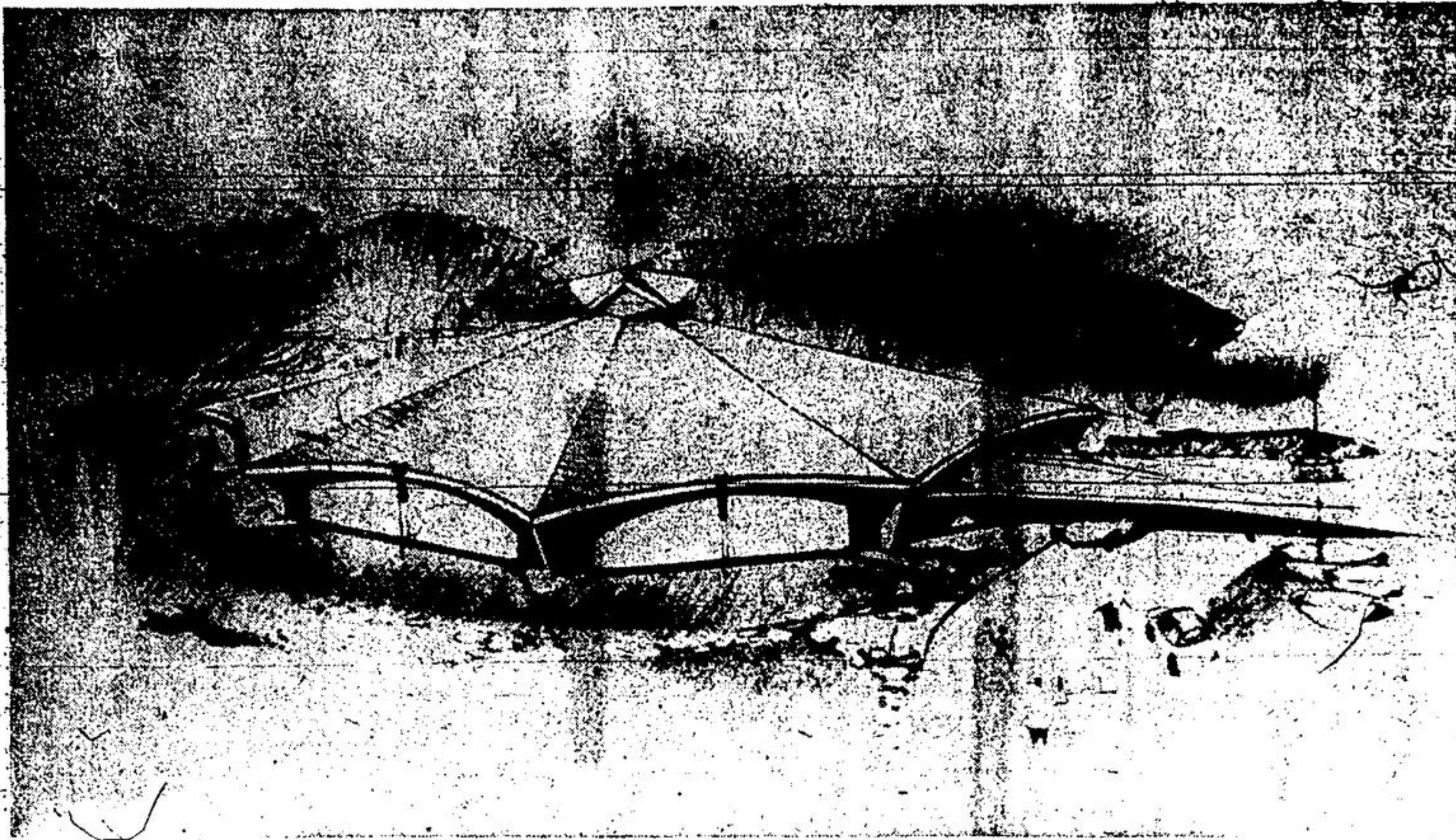
THIS IS IT—FABULOUS "RIVIERA" PLANNED FOR NORVAL