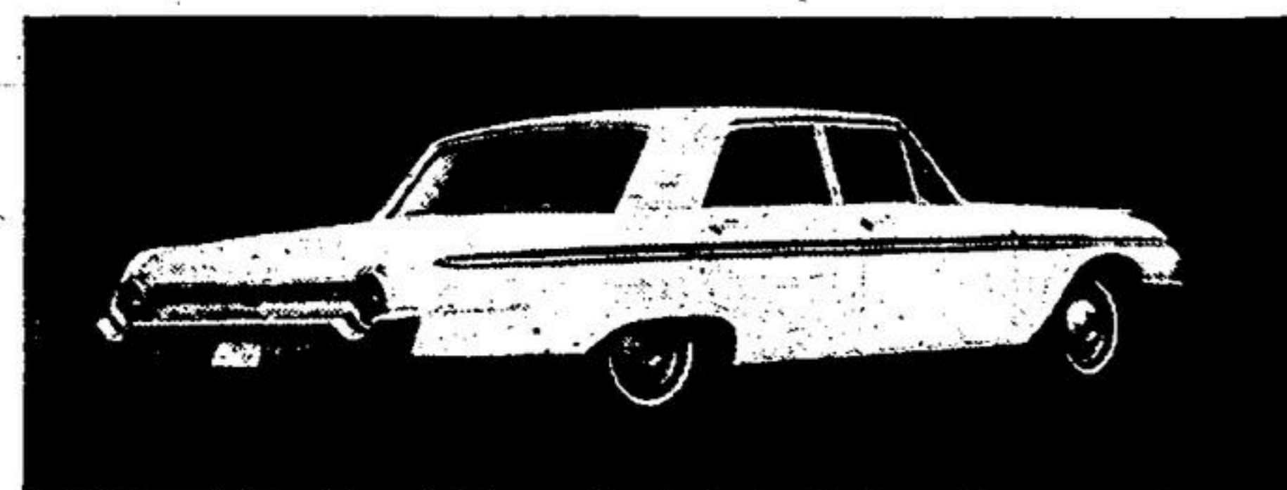
1962 GALAXIE '500'

The 'distinctly Falcon' lines of the 1962 Ford Falcon have been retained while adding styling refinements to the exterior and mechanical and engineering improvements that make this 'best-selling' Canadian compact even more economical to maintain than at any time since its introduction in October, 1959.