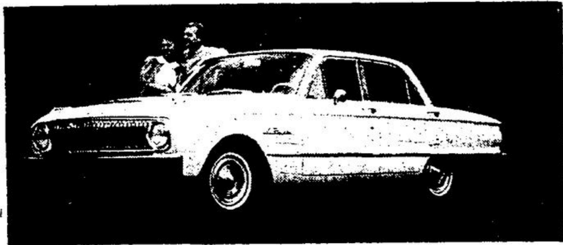
1962 FORD FALCON

FOR BIG STORE SHOPPING SIMPSONS-SEARS FOR CATALOGUE MERCHANDISE