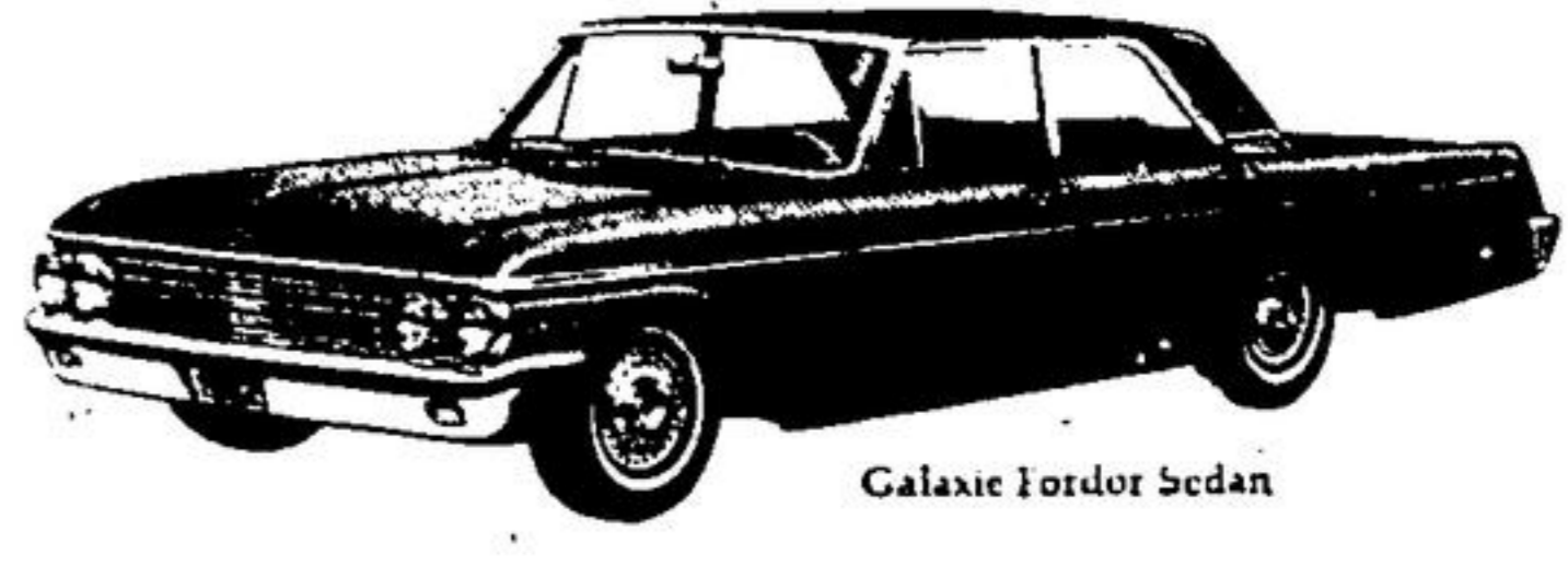
Galaxie Fordor sedan

Both series give you: up to 30,000 miles between lubrications; self-adjusting brakes; vital body parts treated to resist rust and corrosion; aluminum, double-wrapped muffler; no-waxing Diamond-Lustre finish; up to 6,000 miles between oil changes; 30,000-mile or 2-year radiator coolant. Your Ford Dealer gives you a warranty for 12 months or 12,000 miles, whichever comes first. See your Ford Dealer now!