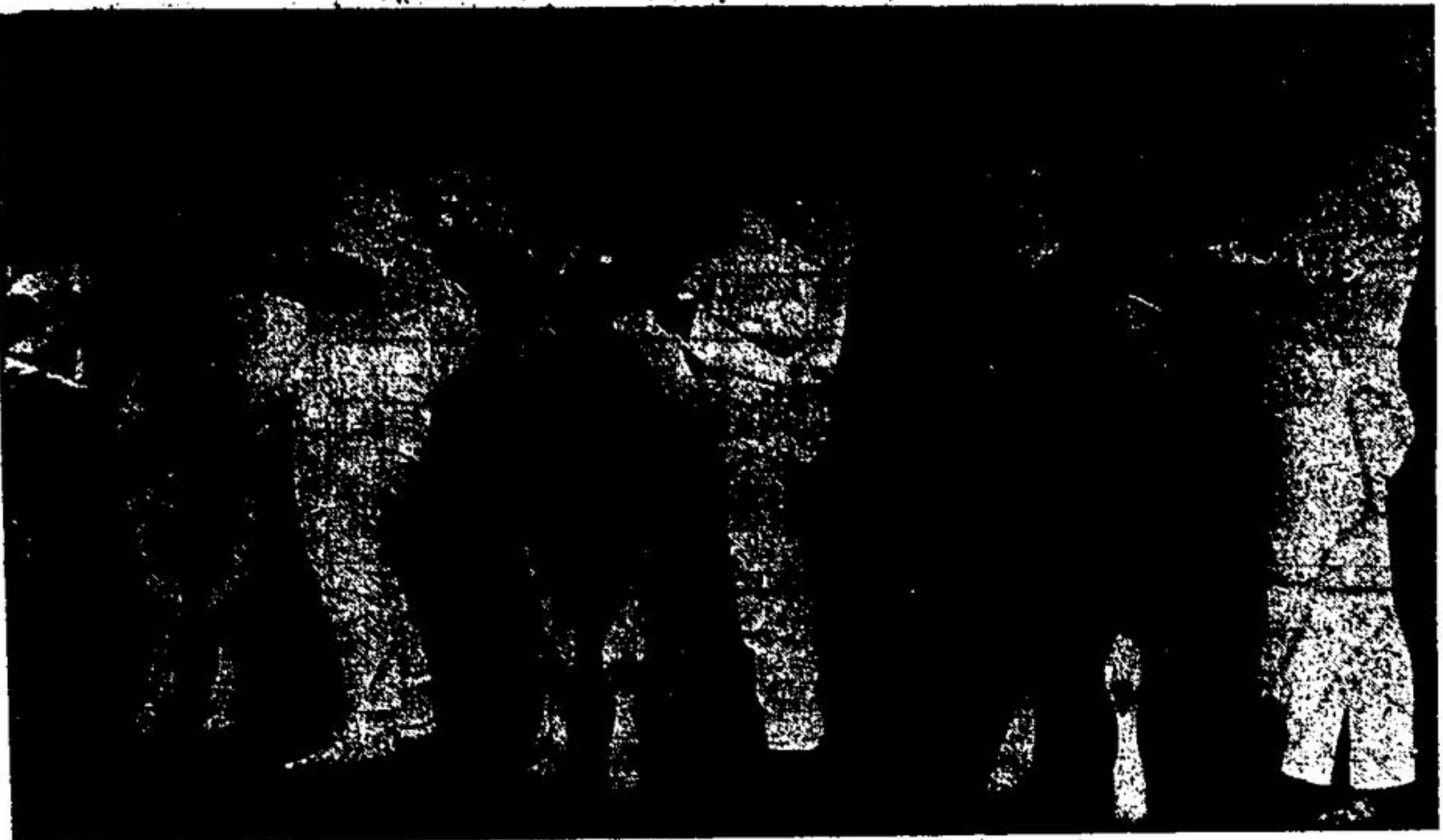
TOP HOLSTEIN CALF TRIO