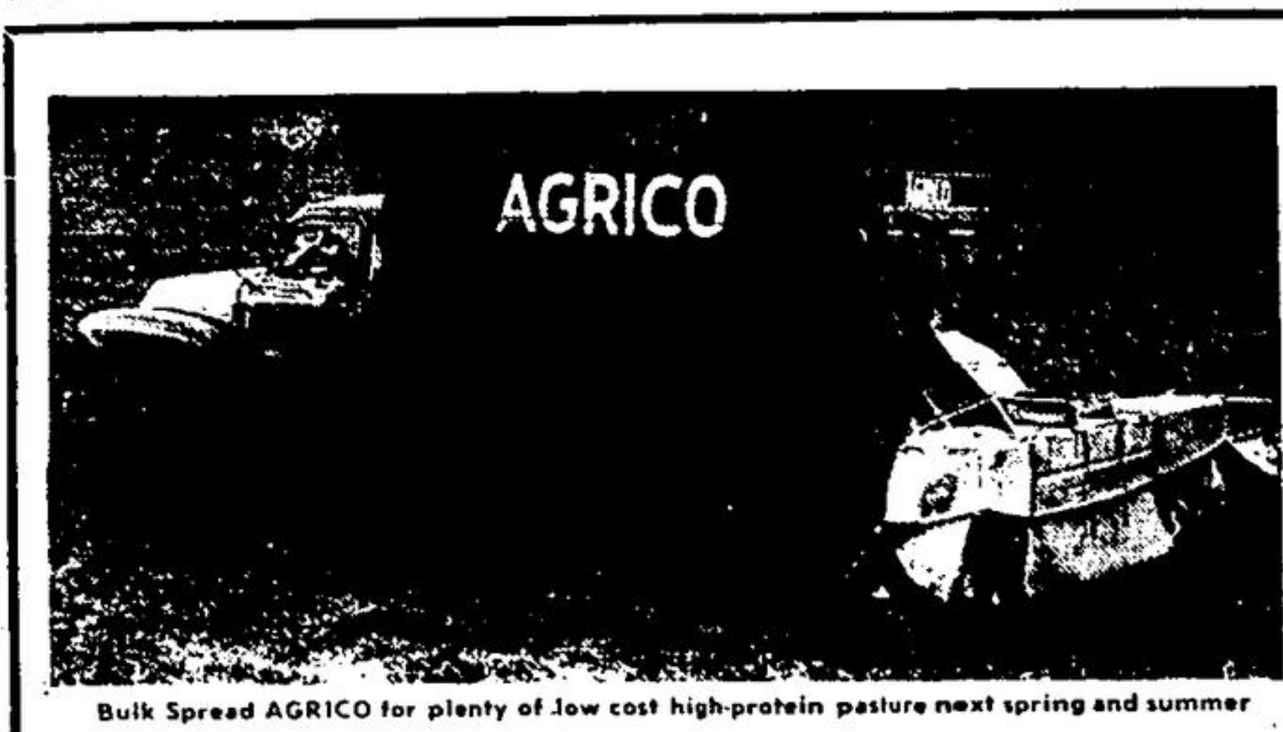
Bulk Spread AGRICO for plenty of low cost high-protein pasture next spring and summer