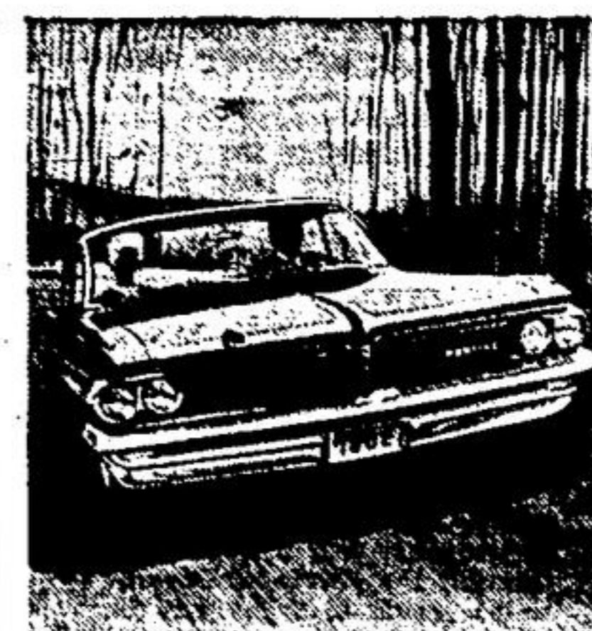
Strato-Chief 4-Door Sedan

Striking new taillights highlight the impeccable styling of the '62 Pontiac's rear deck