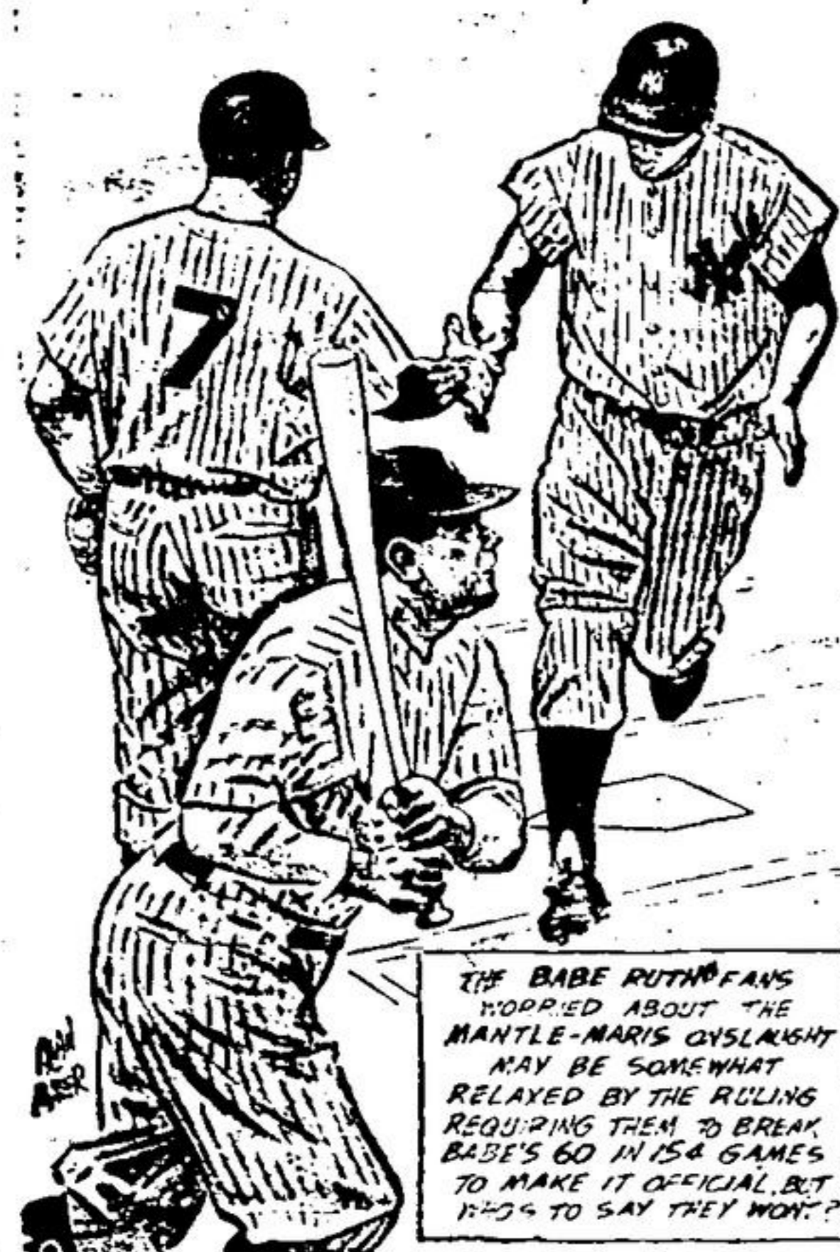
THE BABE RUTH FANS HOPPED ABOUT THE MANLY MARY'S GYSLIGHT MAY BE SOMEWHAT RELAXED BY THE RULING REQUIRING THEM TO BREAK BABE'S 60 IN 156 GAMES TO MAKE IT OFFICIAL BUT 1929 TO SAY THEY WON?