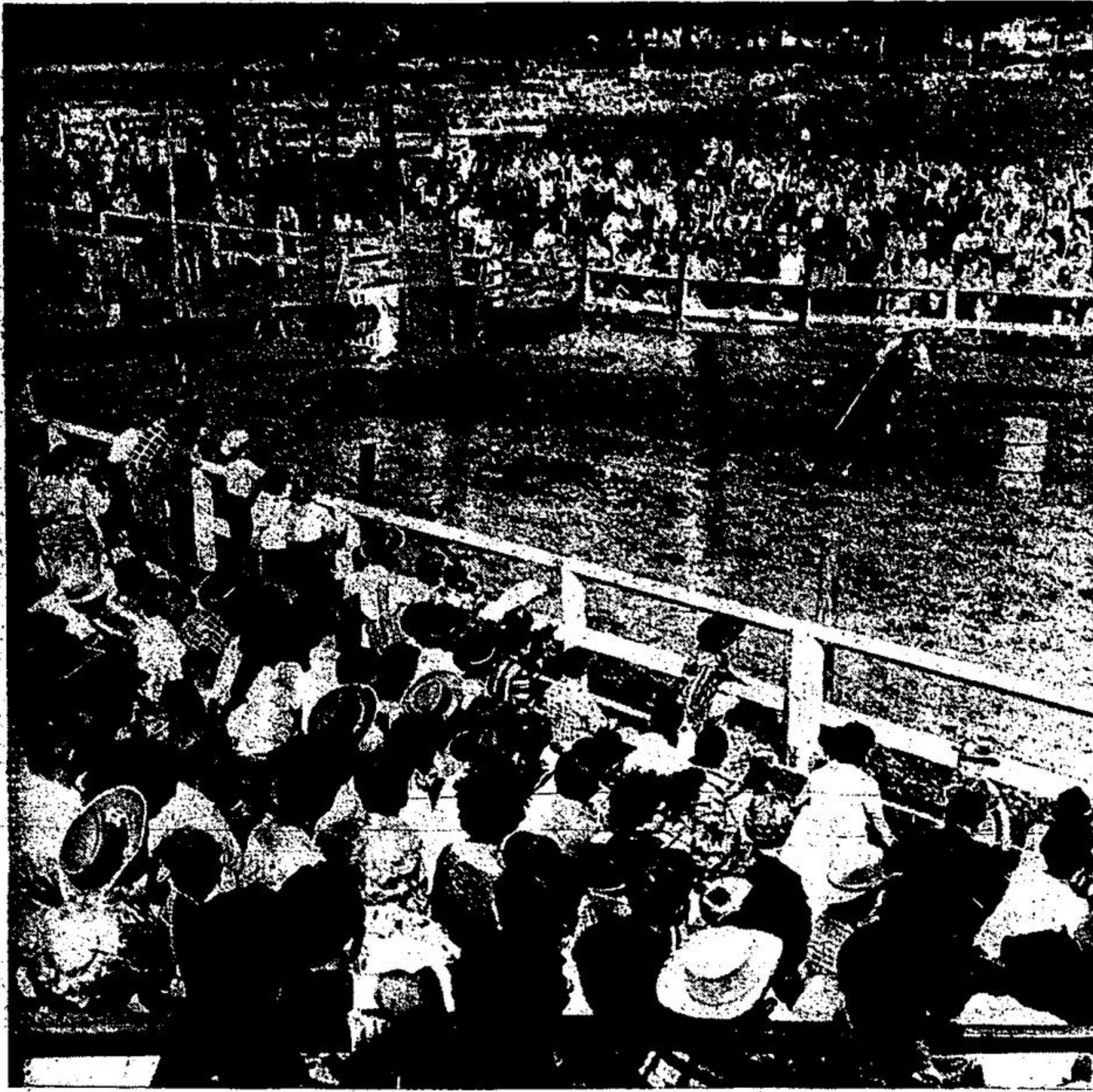
LADY IN A HURRY