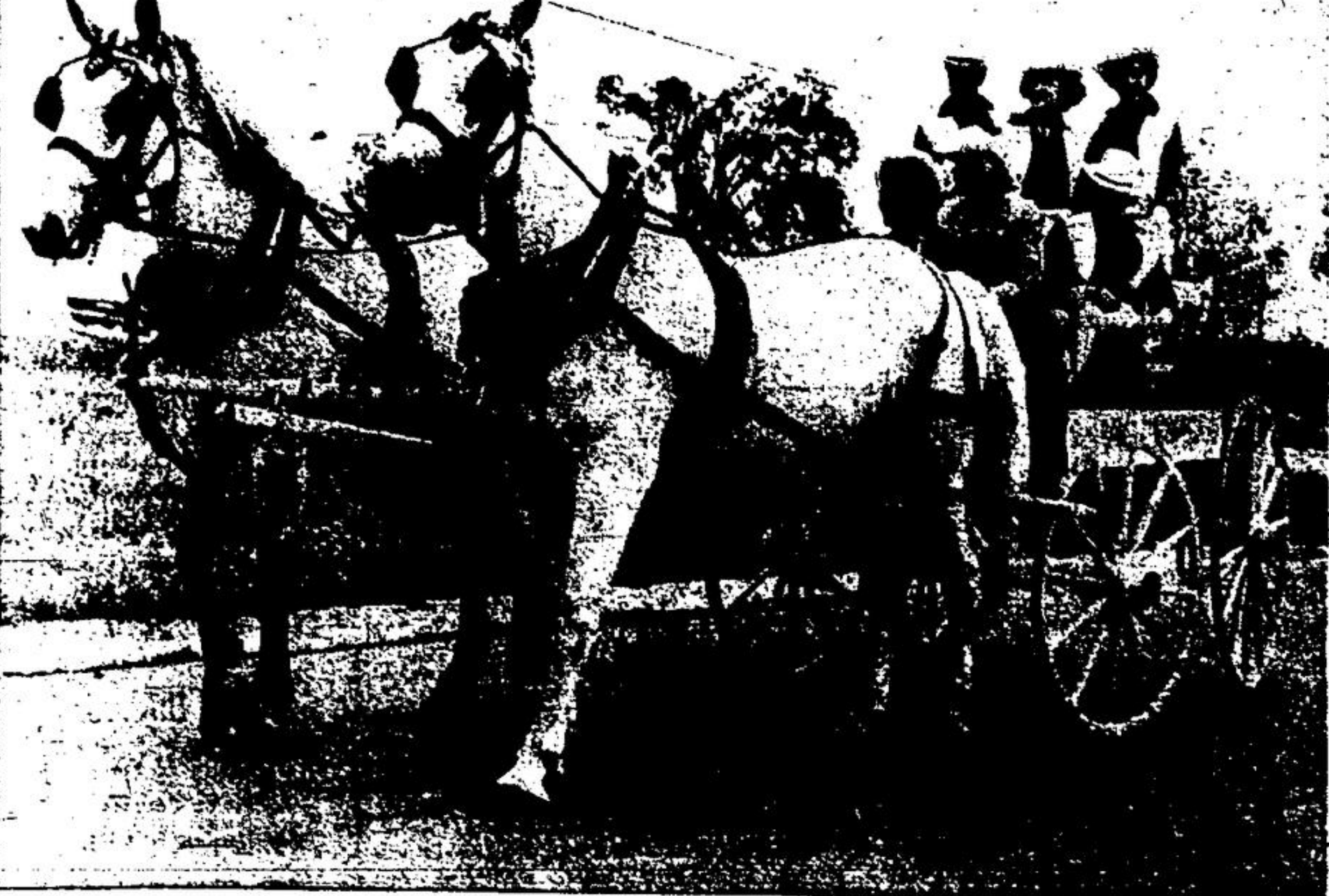
CALM BEFORE STORM THE TEAM OF HORSES which later bolted and seriously injured one of the Miss Rodeo contestants in a spectacular accident walk calmly to their position in the gala Rodeo Day parade. Moments later the vivacious cargo was dumped rudely in the street.