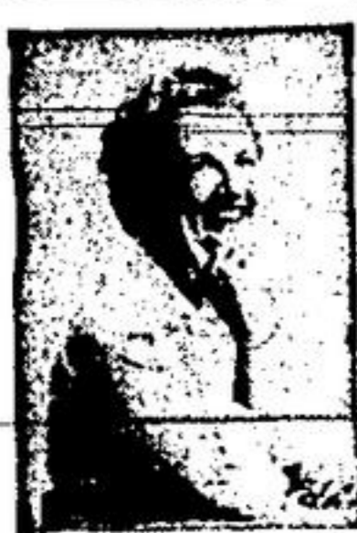
BY DOROTHY BARKER