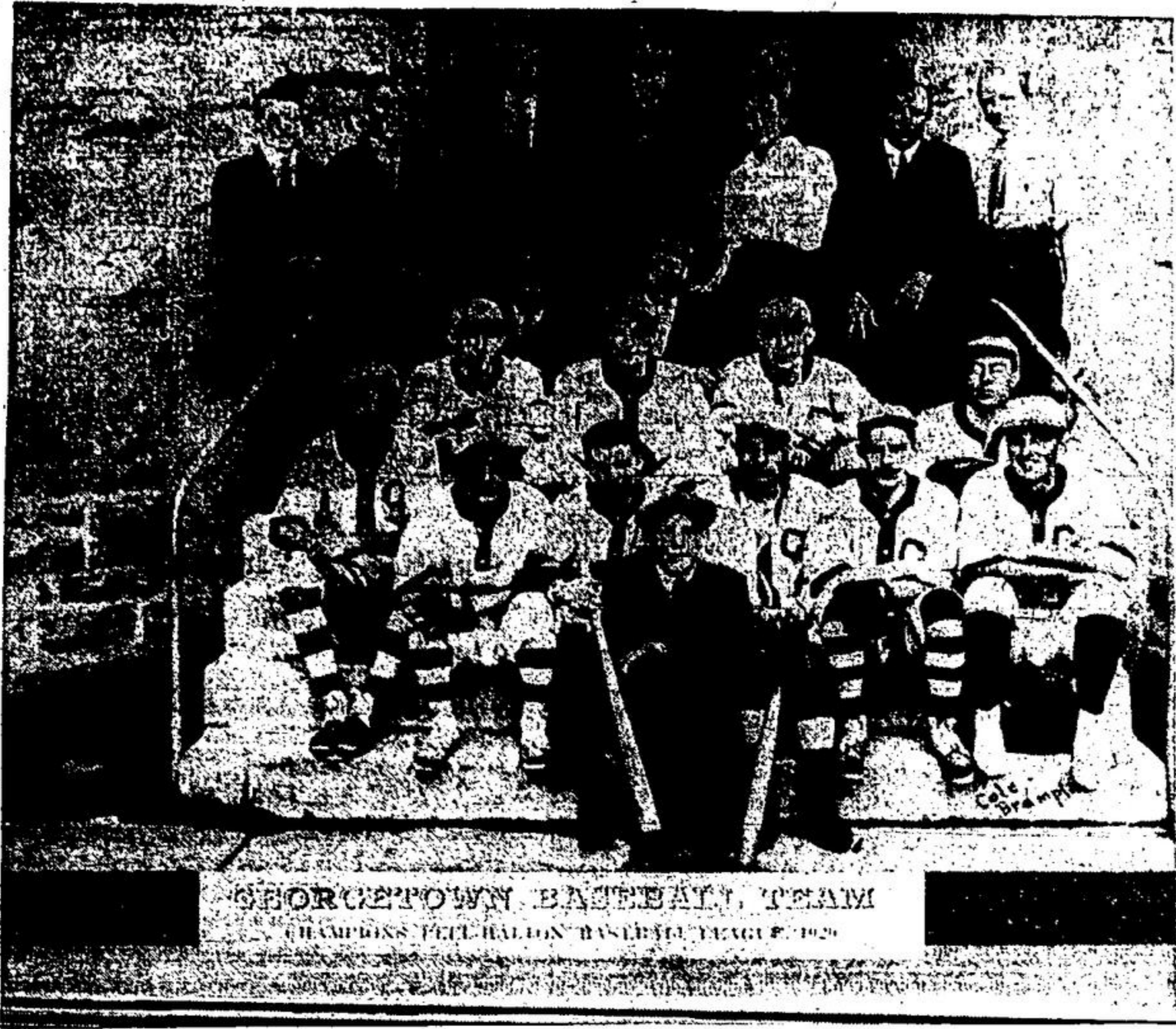
GEORGETOWN BASEBALL TEAM CHAMPIONS OF THE HALLON BASEBALL LEAGUE 1959