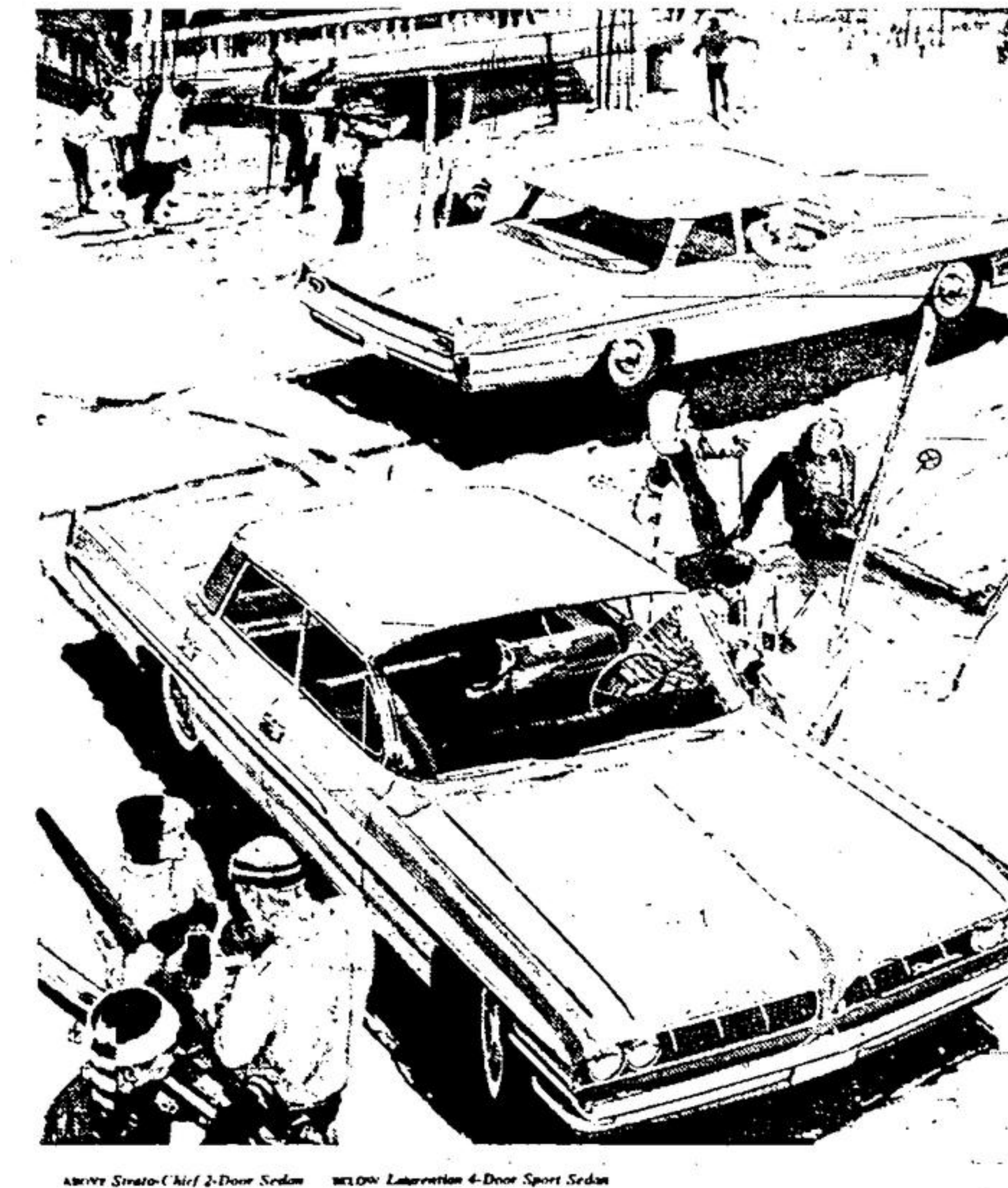
Arrow Stream Chief 2-Door Sedan 1961; Liberator 4-Door Sport Sedan