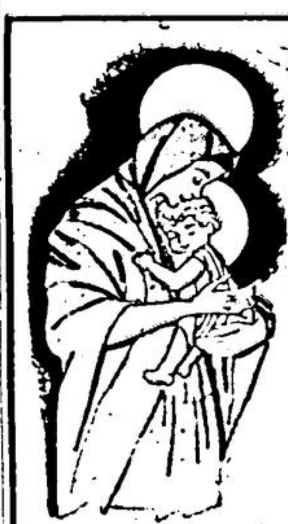
Greetings at this Holy Season... may it be a happy time for you.