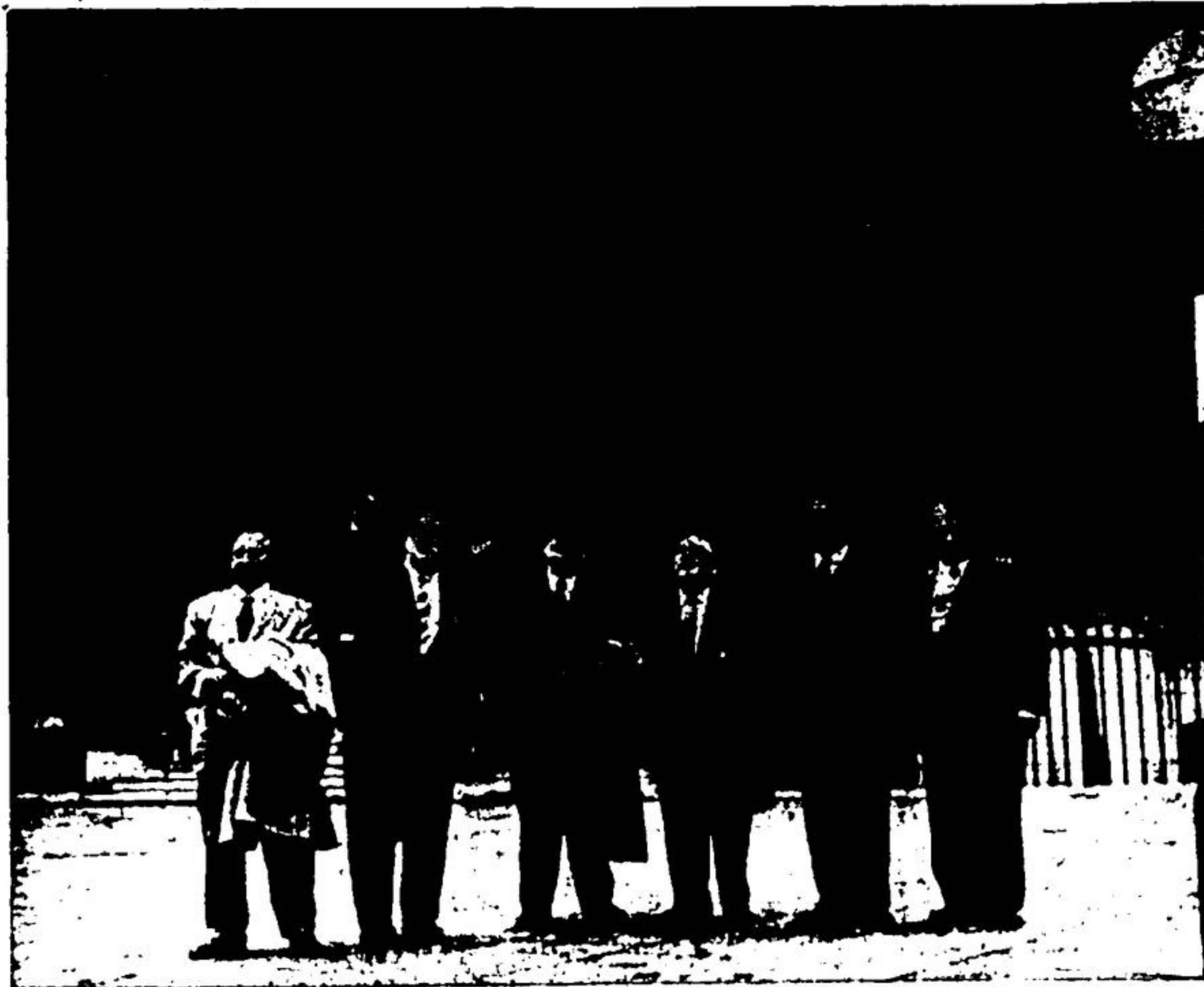
CANADIAN FARMERS IN LONDON