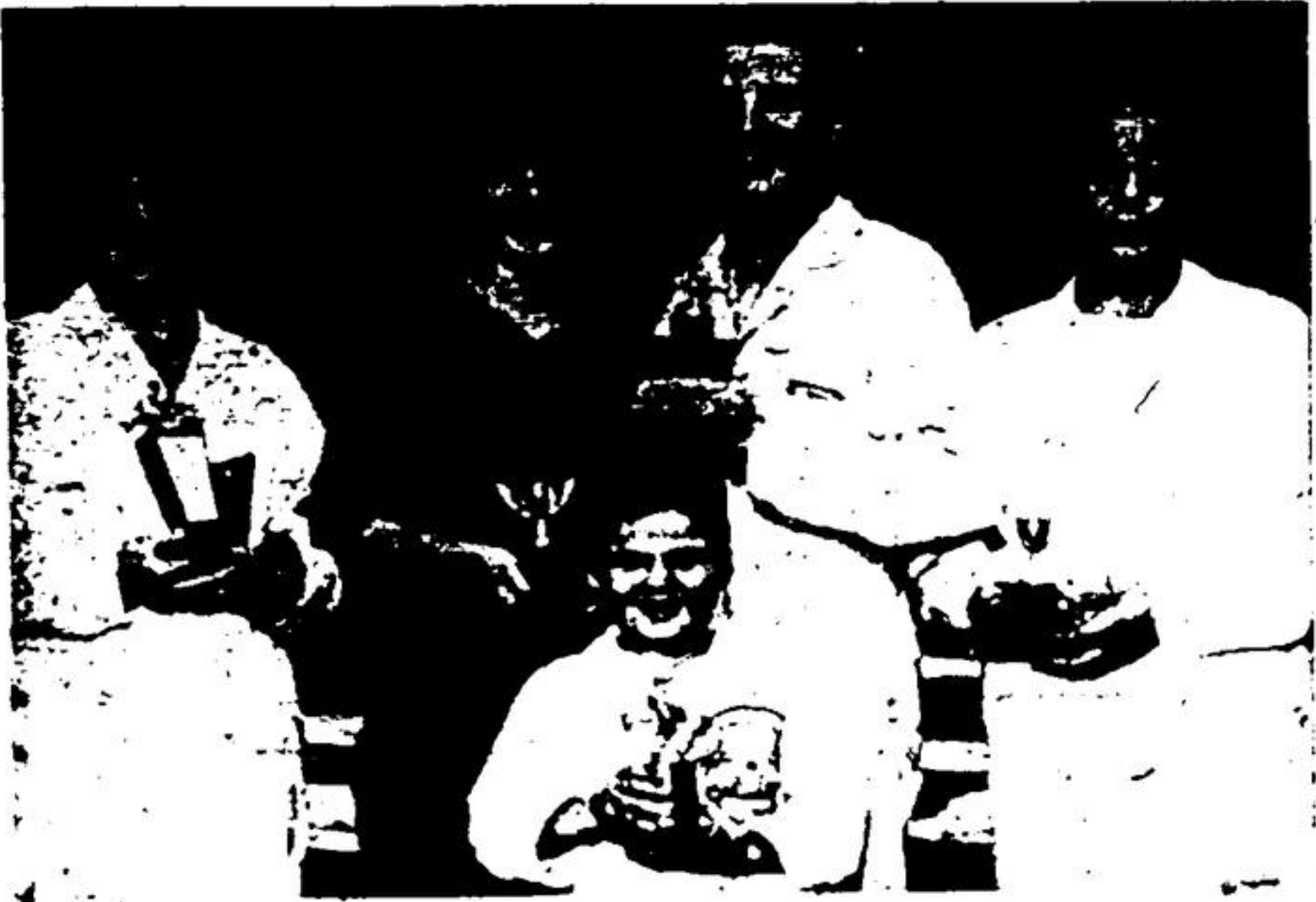
PROUD KART PILOTS